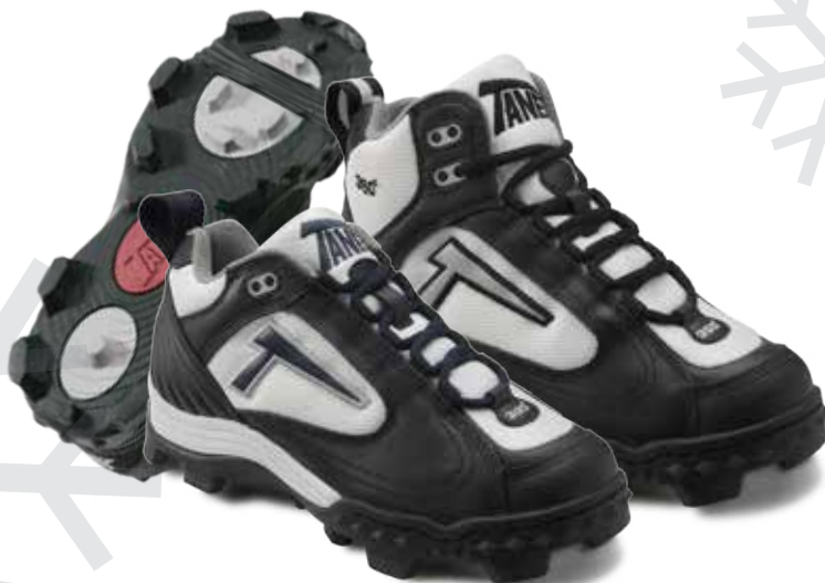
REV-D CLEAT - LOW/MID

It's cold outside but these prices are HOT! Up to 70% off!