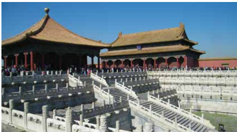
The Forbidden City in Beijing.