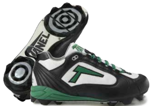
RPM LITE CLEAT - LOW

Select colors and sizes on sale. Prices are available while supplies last.