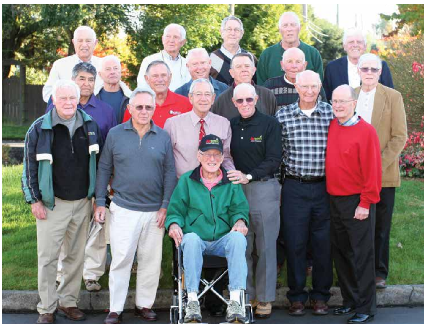
The Mayor of Tacoma and the Pierce County (WA) Executive proclaimed October 27 Joeseppi's Senior Softball Day. Joeseppi's Italian Ristorante team, above, are the 80+ Major World Masters Champions.