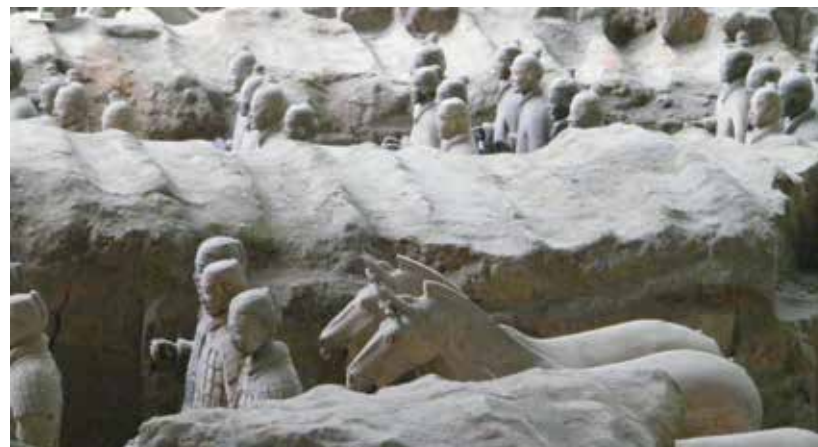
Hundreds of Teracotta soldiers stand guard in Xi'an.