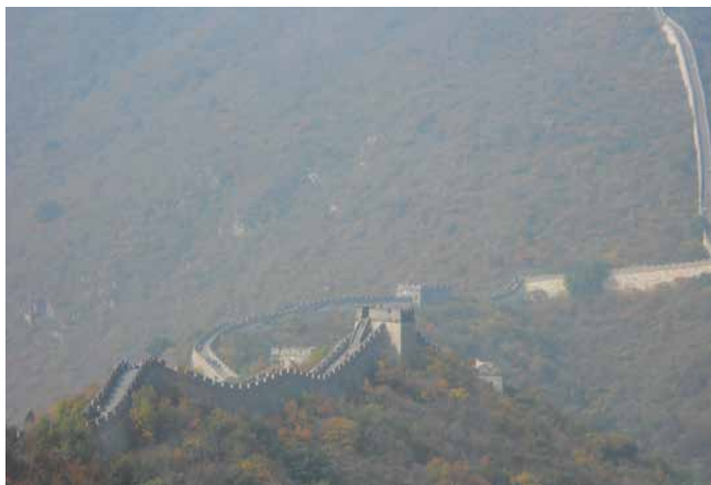
The USA teams visited the Great Wall.

lished, details will be announced by International Sports Holidays via e-mail, on www.seniorsoftball.com and on Facebook at International Softball-SSUSA.