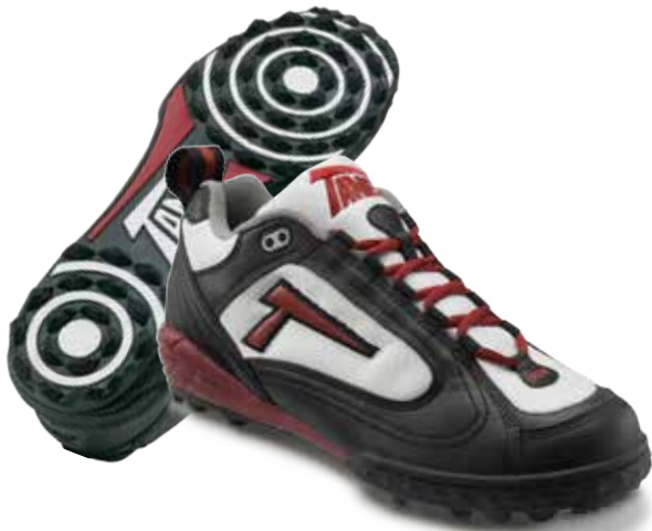
RPM TURF SHOES - LOW/MID

It's cold outside but these prices are HOT! Up to 70% off!