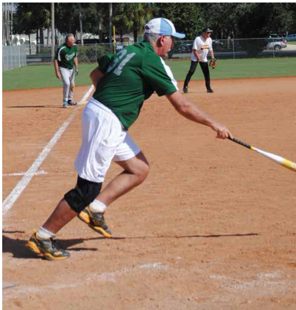
The Winter Nationals gave teams a chance to play with their 2014 rosters.

In the 60+ Majors, Team Deluxe/Bradford of Delaware was forced into an IF game after losing to Metro Hitmen of New Jersey 18-9. Team De-