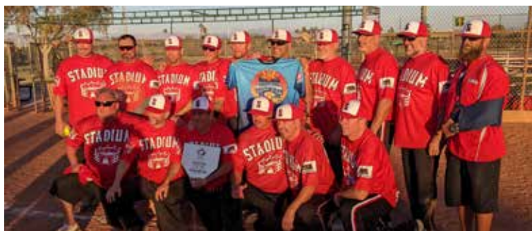
Stadium 50 (CA)