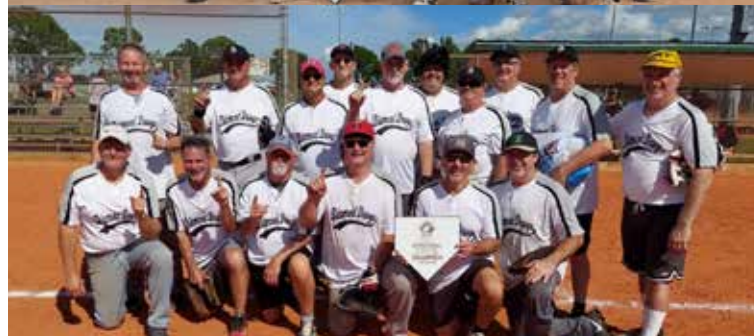
Top: PA Senior Hitmen 50 / Bottom: Diamond Dawgs 60 (MA)

game series, as Diamond Dawgs (MA) swept Glory