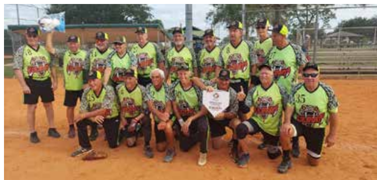
Venom 75 (FL)