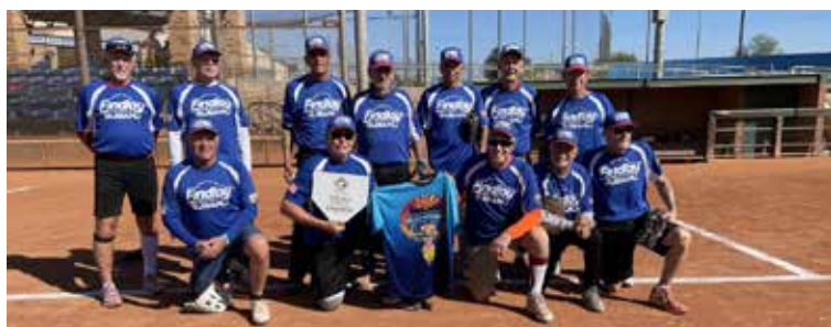
Scorpions 80 (AZ)