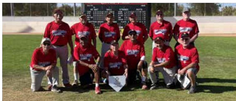
New Mexico Boomers 70

In the 19-team Men's 65 AAA Division, Plainsmen (NE) went 5-0 in bracket play, including a 19-4 win over Last Call (NV) in the championship game.