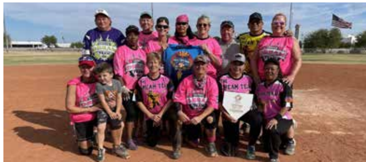
The Dream Team 55 (AZ)

Blue Point won three straight elimination games to