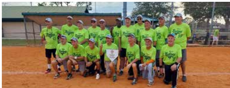
Florida Mustangs 70