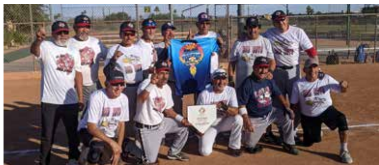
El Paso Bad Boys 60 (TX)

AAA Division, Team Southwest/Woodies (NM) avoided the dreaded double-dip, by knocking off Crawfords (MI), 20-17, in the "if" game.