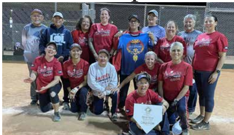
Saints 40 (AZ)

In the three-team Men's 80 AAA Division, top seed Scorpions (AZ) went 2-0 in bracket play, including a 28-