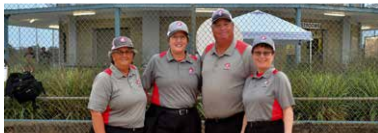
SSUSA Umpires at the 2020 Tournament of Champions

If you would like to get registered, you can access the SSUSA Umpire registration form by clicking the following link: https://seniorsoftball.com/forms/form_umpire.pdf