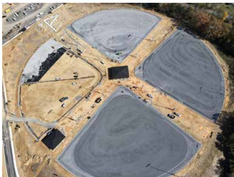
Riverbend Park (Dalton, GA) is a brand-new four-field (turf) complex set to open in April 2022. Riverbend will host the 2022 Southern Championships, Aug. 12 - 14, 2022.

SOUTHWEST CHAMPIONSHIPS - TOC April 19 - April 24, 2022 / Las Vegas, NV