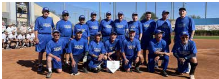
Top Gun Blue Angels 85 (CA)