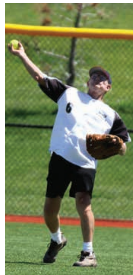
Stark Street Pizza of Nevada, above, lost to Florida Legends/ Human Kenetics in the 70 Major-Plus Division finals.

State Roofing Systems, out of California, grabbed the number three seed in the bracket and slugged their way to the division championship. State Roofing defeated the Oregon Roadrunners in the third round and once again in the final, 16-12.