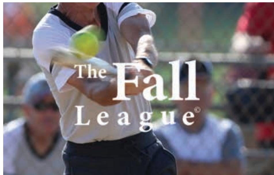
Filming for the documentary "The Fall League" began in the 2013.