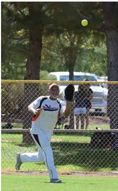
The War Eagles topped 39 teams to win the 60 AAA division.

In the 60 AAA division, 39 teams competed for supremacy in the 60 AAA division, yielding yet another huge draw for the tournament. Like other large division, the bracket was split into American and National pods. Cut Loose took on Dixon ZTR on the American side and Cut Loose prevailed 19-15. The National pod pitted Tubby's Pub against War Eagles with the winner to face Cut Loose for a shot at the division. War Eagles and Tubby's played an extremely close game with the Eagles eking out a 21-20 win. War Eagles carried their momentum into the matchup with Cut Loose, handing them a 16-13 defeat. As a result, Tubby's needed to double dip the Eagles. Tubby's won an offensive shootout against the War Eagles 34-29 but fell short in the "IF," 16-14 and the War Eagles were crowned