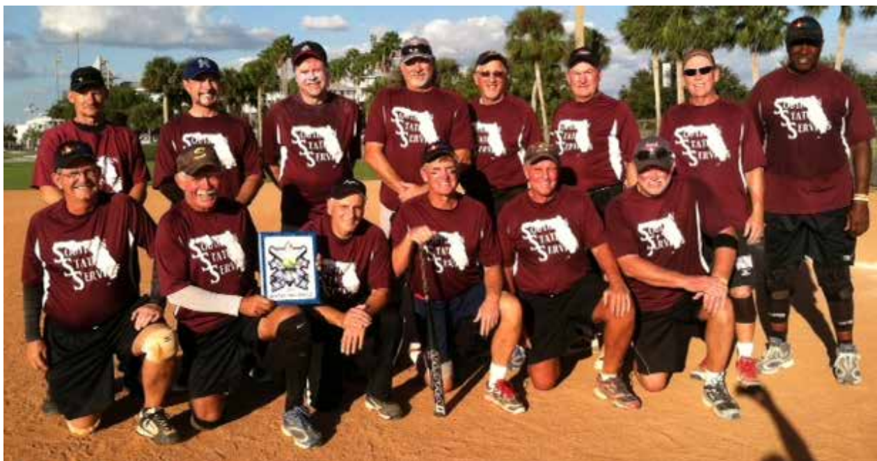
Southern States Service won six in a row to take the 65 Major Championships.

The Men's 70/75 Gold Division featured 11 teams, with three of those teams playing in the 75 Major Division. ProHealth Care 75 (WI) won the division with ease, by winning 13-7 and 36-15. The other eight teams played in the Men's 70/75 Silver Division with Columbus Silver Sticks (IN) taking the top spot by posting a perfect 4-0 record. As the No. 2 seed, Columbus Silver Sticks opened bracket play with a pair of convincing victories, 15-3 and 22-7, setting up a showdown with top seed BackOffice Assoc. 75 (MA). The Silver Sticks continued