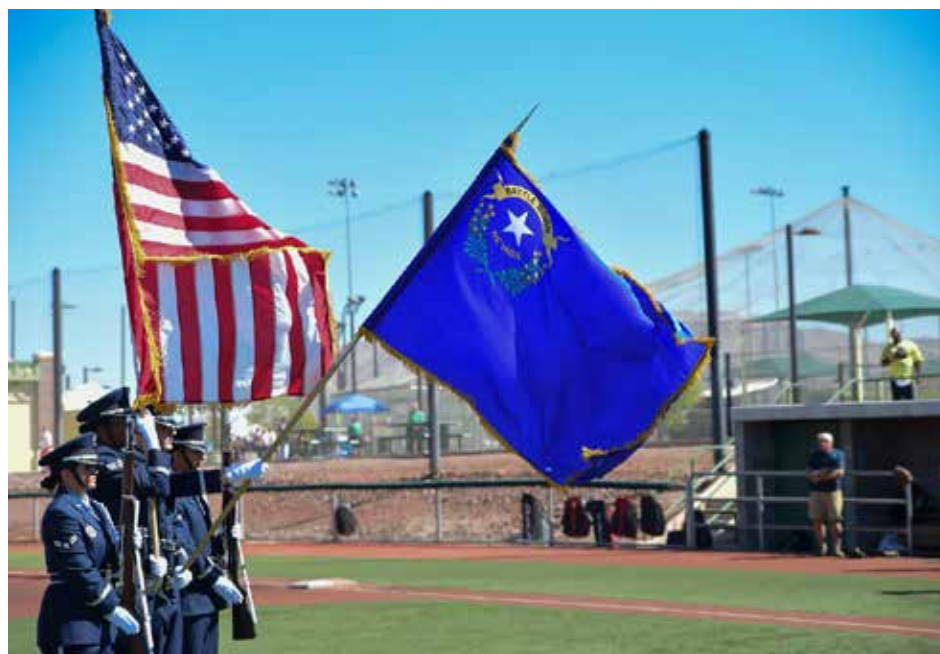
The Nellis Air Force Base Color Guard helped kick off Opening Ceremonies for the 2015 World Masters Championships.

A highlight of the tournament occurred Sept. 28 with the National Senior Softball Hall of Fame induction ceremonies at Big League Dreams' replicated Fenway Park. With many friends and family members on hand,