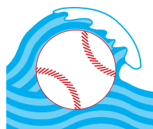
Pacific Rim Slow-Pitch Softball Association

The friendship games are an annual event held to promote and build slowpitch softball in Pacific Rim Countries and rotates to a different nation each year. Games are played with the