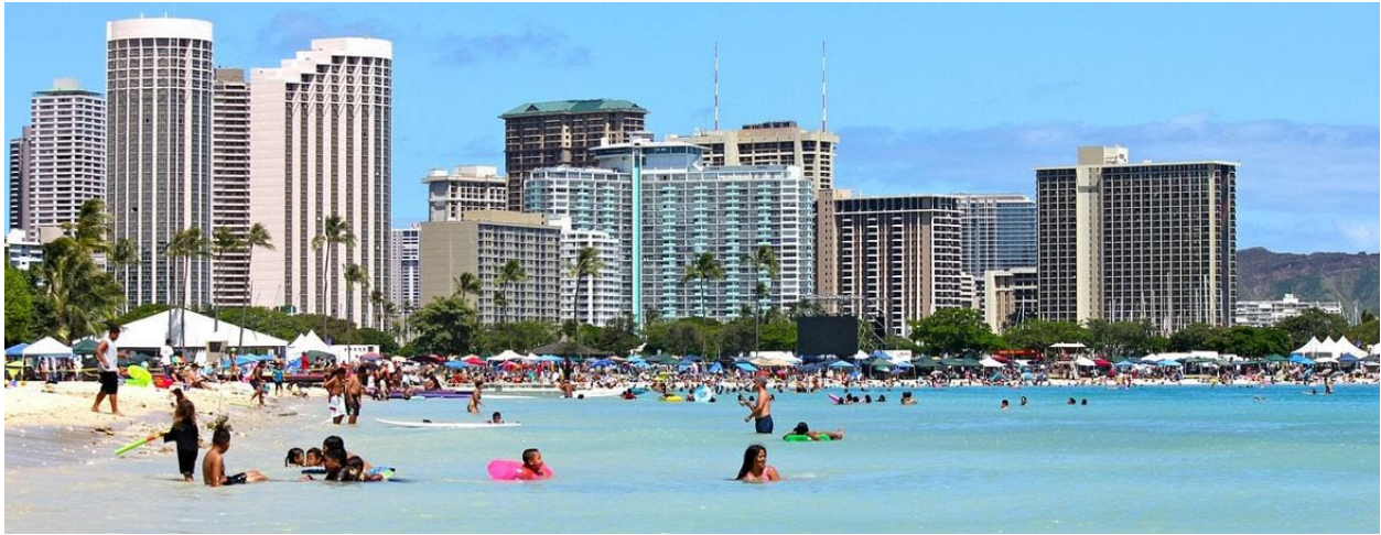
Waikiki Beach with Honolulu Cityscape.

Hawaiian Islands – Tournament Only US and Canadian Players Only