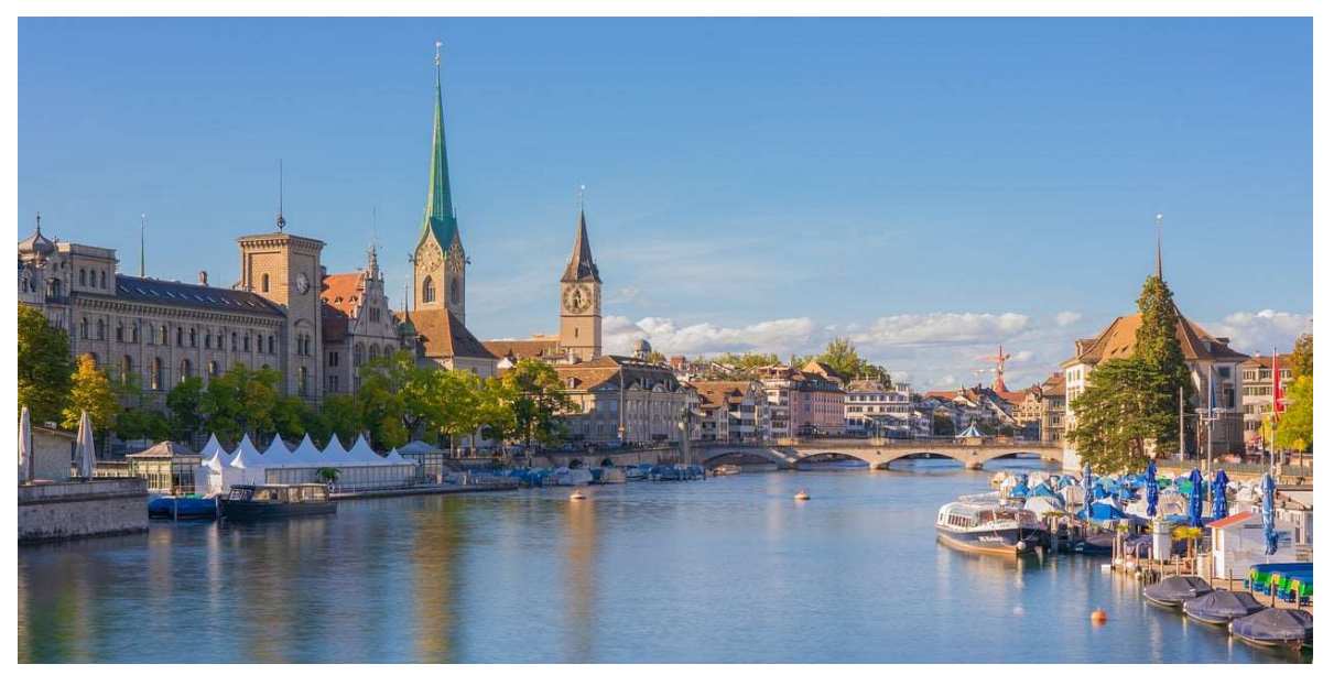
Limmat River, Zurich, Switzerland.

Join Senior Softball USA as we travel to the Swiss Alps, the Black Forest and through one of the most picturesque villages in France. Our tour will take us to Switzerland, France and Germany; to the top of the Swiss Alps, across rivers, through the Black Forest in Germany, to the cuckoo clock capital of Europe, on two scenic cruises (one on the Rhine and the other in Lucerne), and back through the ages to a fairytale French City. There will be a Swiss Folklore dinner at Stadtkeller, you'll see the Heidelberg Castle, home to the Holy Roman Empire Kings, and much more.