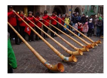
World Known Alphorns

Hotel: Grand Hotel Europe - Haldenstrasse 59, 6006 Luzern, Switzerland