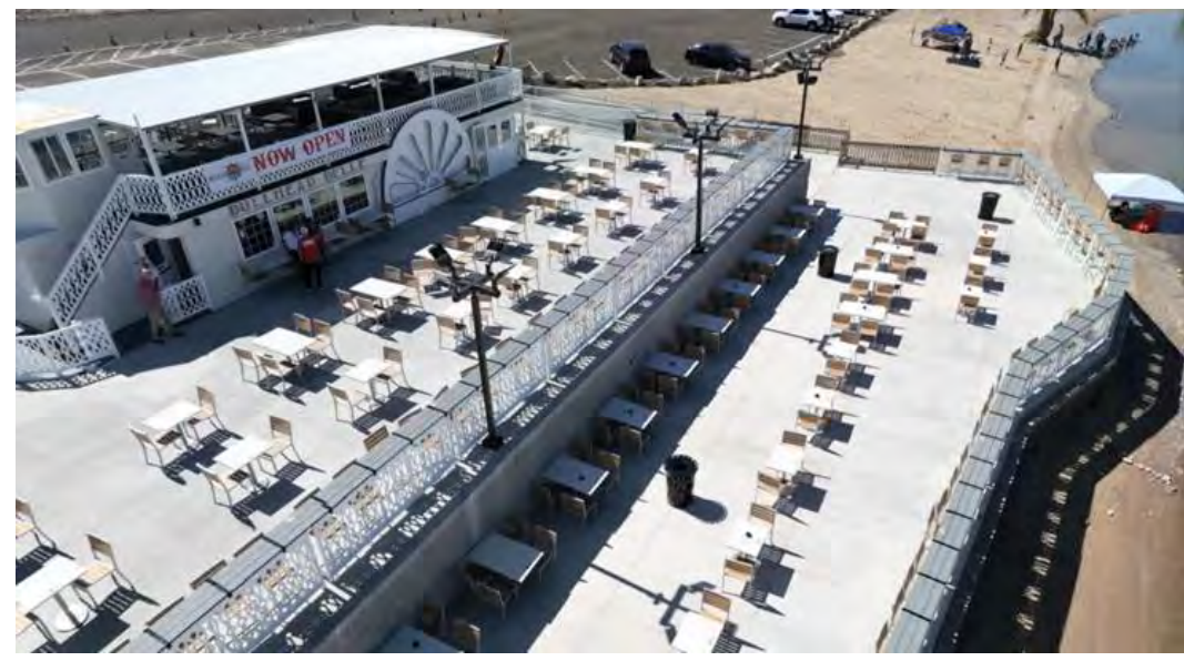
Bullhead Belle beach front restaurant