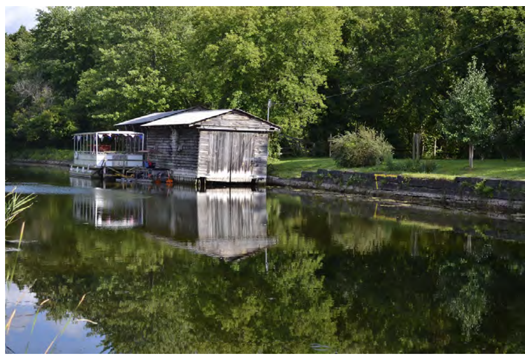
The Erie Canal connects the Hudson River in East New York to the Great Lakes.