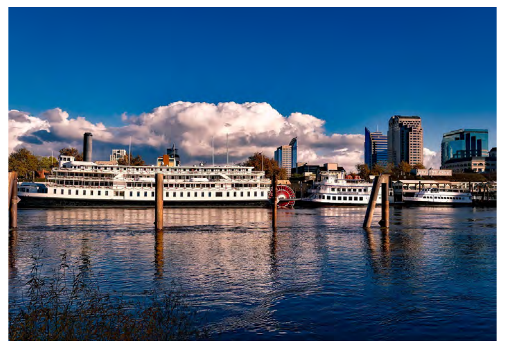
Delta King Steamboat (Hotel & Restaurant) on Sacramento River.