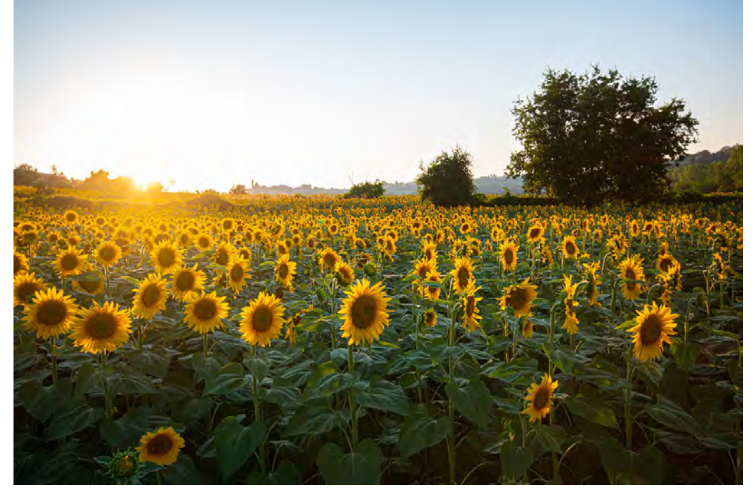
Kansas' official state nickname is the "Sunflower State".