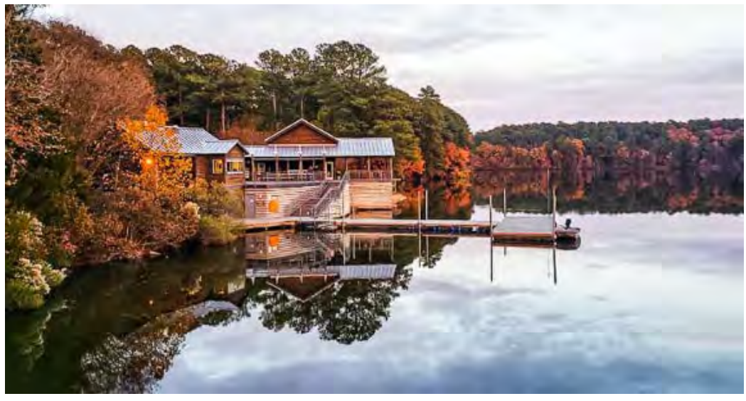
House on Lake Johnson (4601 Avent Ferry Rd) in Raleigh