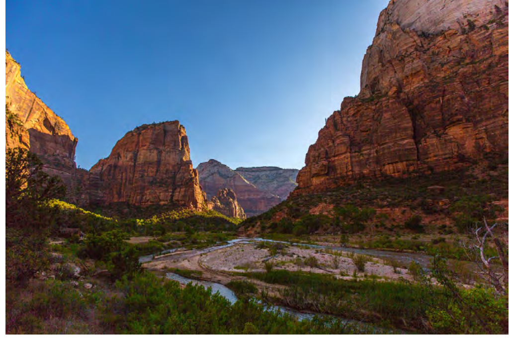
Angel's Landing in Zion National Park