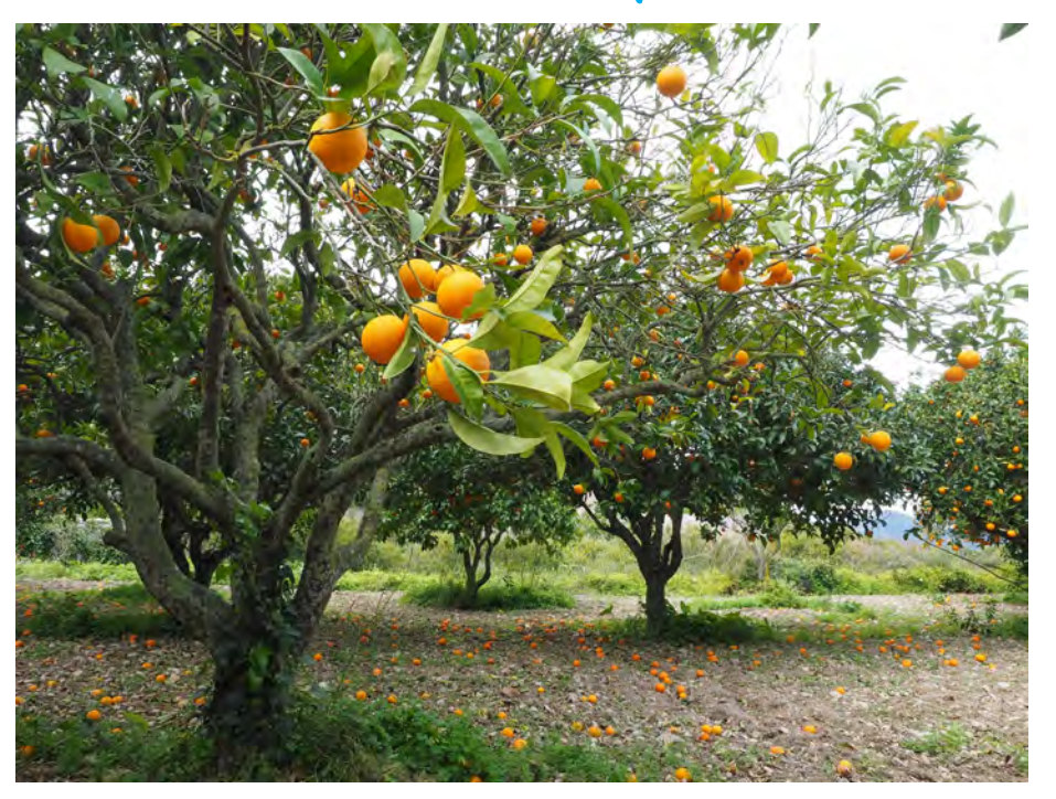
Central Florida oranges are used by some of the most famous orange juice brands.