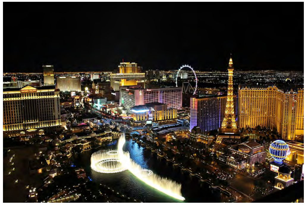
Night Skyline of the Las Vegas Strip