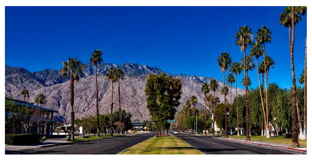
Palm Springs, neighboring Cathedral City.