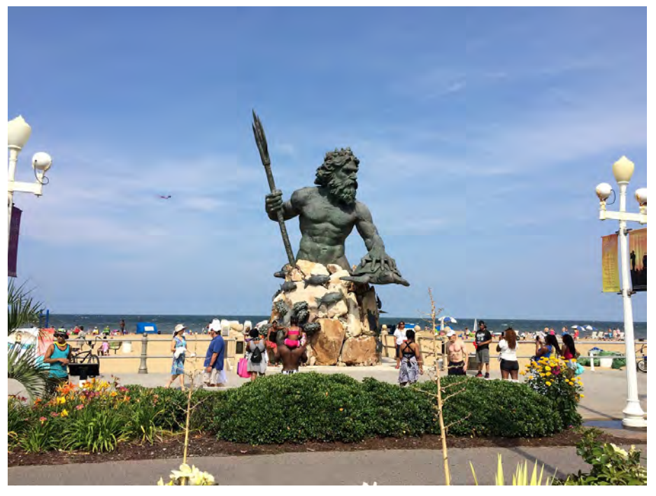
King Neptune Statue at the Virginia Beach Boardwalk.