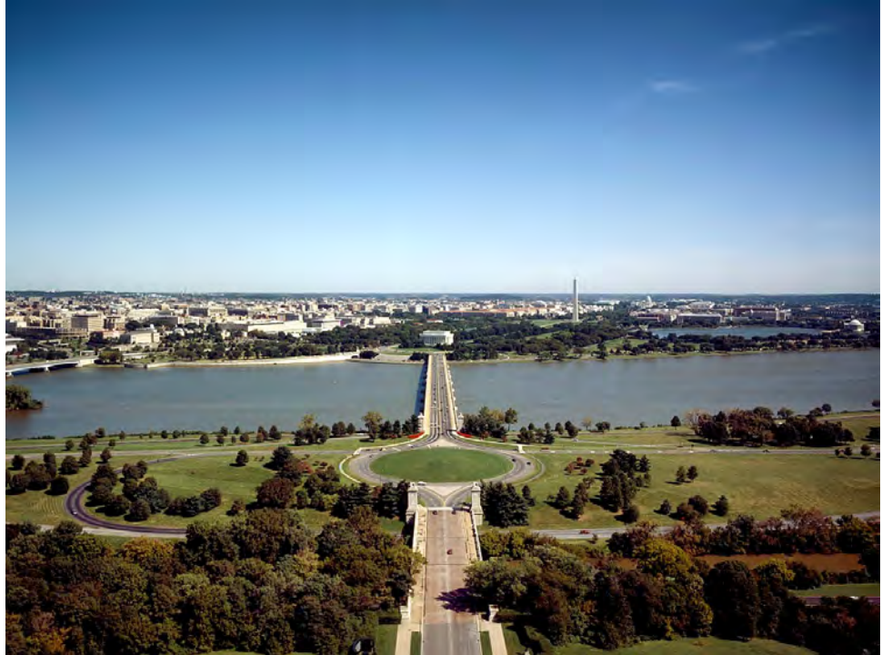
Loudoun County with bridge over the Potomac River with Washington DC behind.