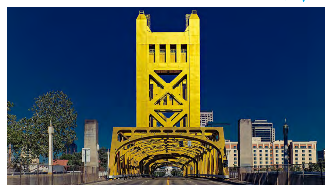
Tower Bridge crossing the Sacramento River with Downtown Sacramento behind.