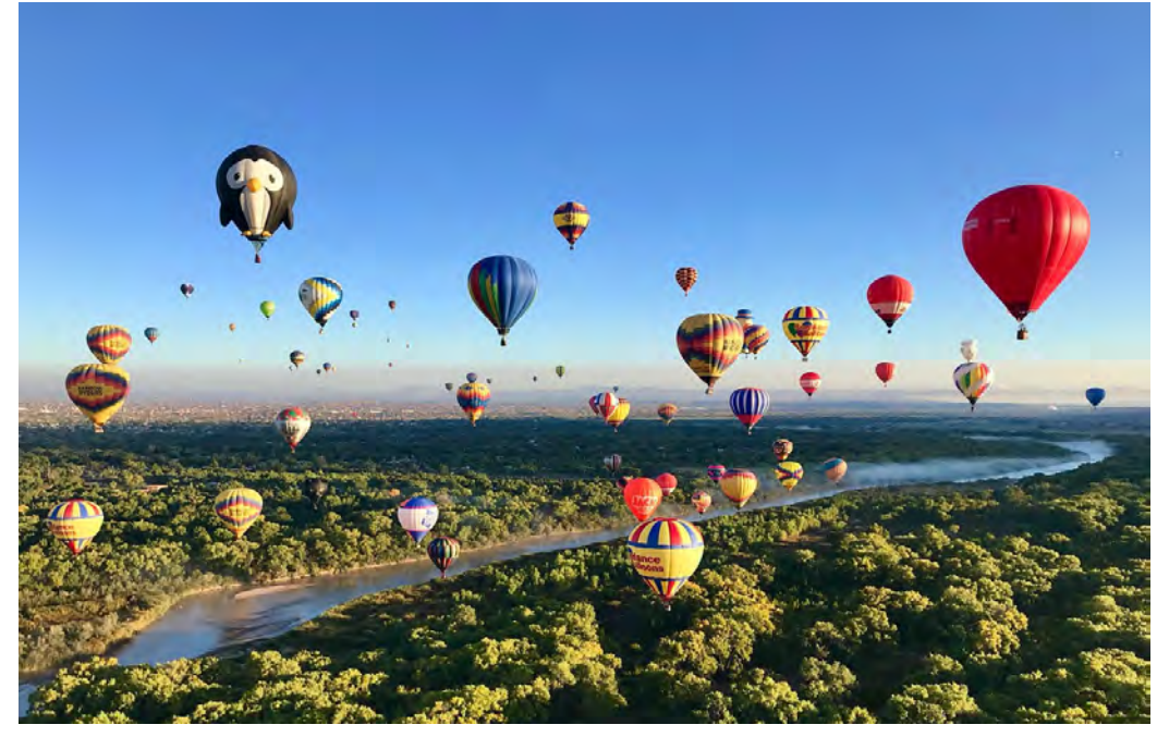
Albuquerque's International Balloon Festival over the Rio Grande.