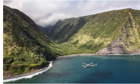
Hilo Helicopter Tour