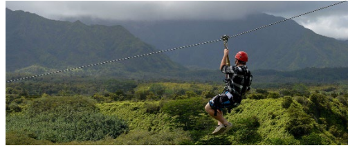
Zip-Lining in Kauai