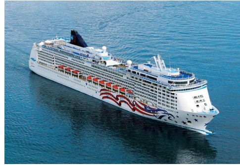
'Pride of America' Cruise Ship