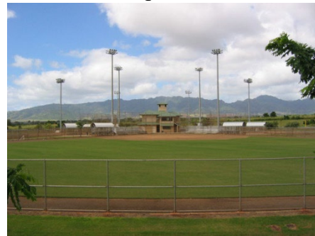
CORP Softball Complex