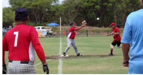
Trying to Leg out a Triple