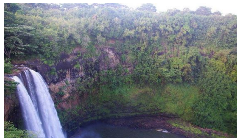
Wailua Falls, near Nawiliwili Port