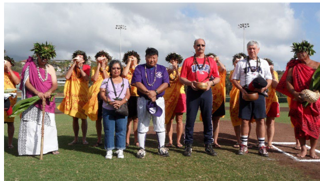
Hawaiian Field Ceremony