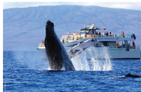
Whale Watching Tour in Kahului