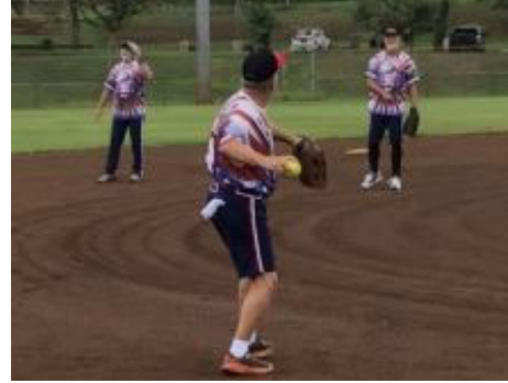
The 2024 Pacific Rim Championships was hosted by the USA in Hawaii.

Our motorcoach will transport us back to the hotel after dinner. The rest of the night is yours to enjoy!