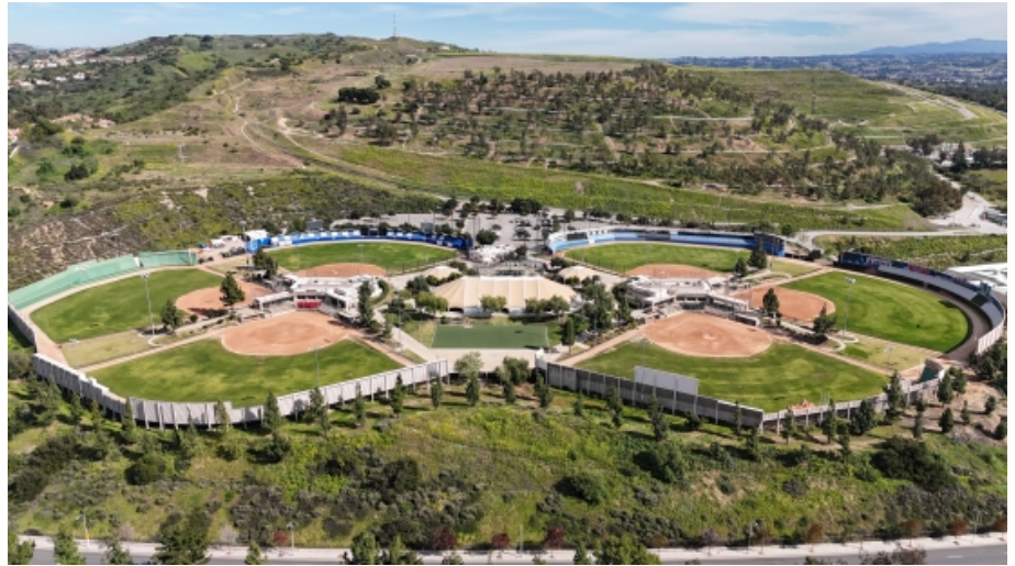
West Covina Sportsplex was home to the 2026 Top Gun Winter Classic. A former Big League Dreams location, the complex has six fields, a soccer and rugby pavilion and two playgrounds.