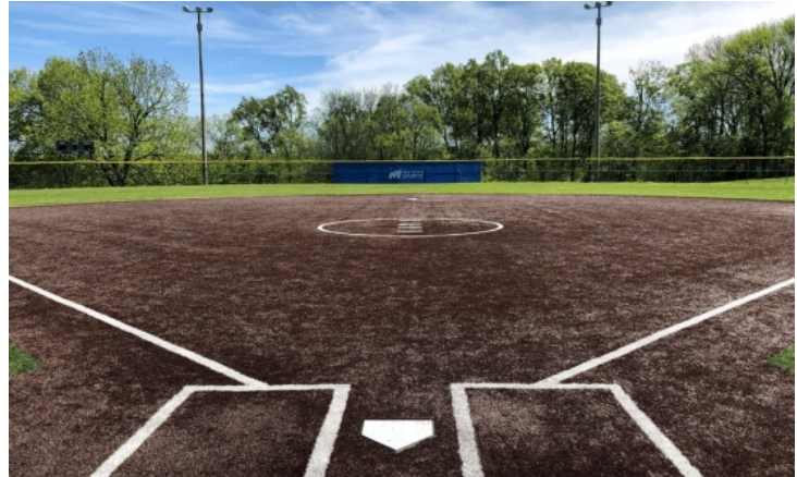
Newly completed turf fields at Cane Ridge Park in Anitoch, TN., a suburb of Nashville.

The complex’s new turf fields allowed for quick recovery and the teams were able to play all their games by the end of Sunday evening in the March 7-8 qualifier.