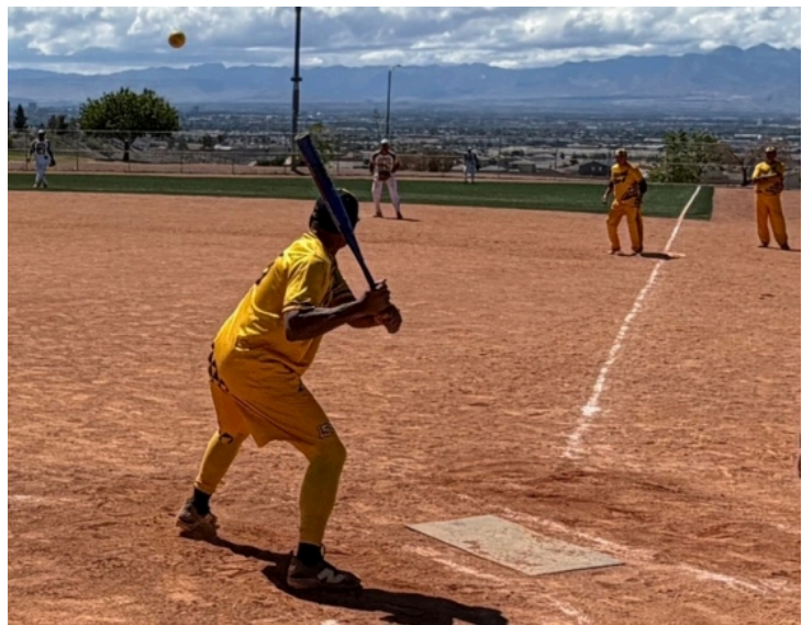
Hawaii Five-O up to bat in their Southwest 60+ Major Plus championship game against County Heating & Air of California, a division won, undefeatedly, by County Heating & Air.

Competitive games dominated many of the brackets, with one-run games deciding 12 of the 33 divisions. Three of the five women's divisions came down to just one run.