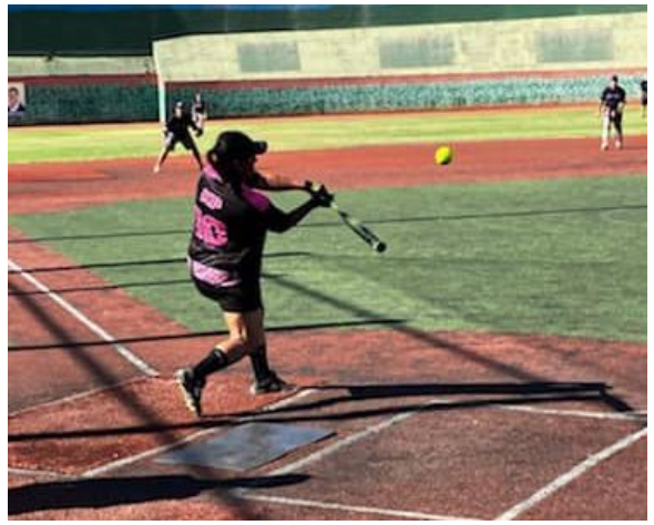
Batter from International Co-Ed Team, Tips and Lips (CA), Mid-Swing

The final four-day session drew 142 men's 50+ teams, 24 women's 50+ and 55+ teams, and six coed teams. Four men's teams, two women's teams and one coed team left the playing fields as World Champions.