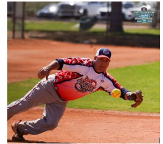
Action Shots from the 2023 Southwest Championships. (Xcelerated Softball 60s, left, and Legacy Sports USA 60s, right).