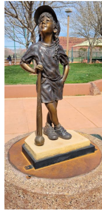
'Little League Girl' statue at The Canyons Complex in St. George, Utah.

Those teams that decide to withdraw before the games or division is canceled (which is extremely rare) receive no refund.