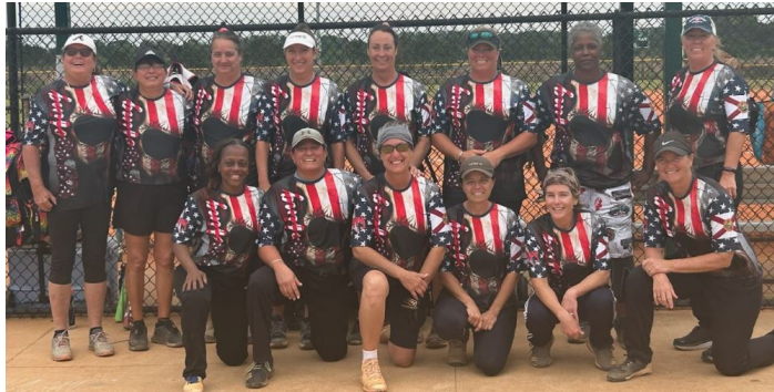
Men's 40+ Major Plus: Suncoast/Adidas 40s of Florida swept DDA Nation of Florida 30-24 and 32-31 in a best-of-three format. Suncoast finished overall.

Men's 40+ Major: Top-seeded Select 40s of Florida earned the title the hard way. After losing its first bracket game 20-10, Select reeled off victories 31-24, 34-26 and 26-25. It averaged 25 runs per game in bracket play. Hooters of Florida took second. Shinbiscuit/Potomac Sports of Maryland finished third in the three-team division.