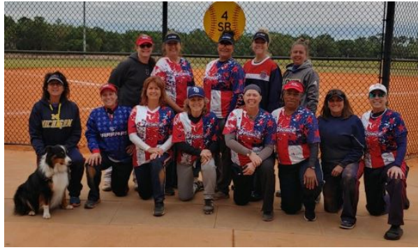
Women's 50+ AAA: In a best-of-three format, unbeaten BAGS of Florida (photo below) defeated Hot Flashers of Texas 32-12 and 21-6 to win the