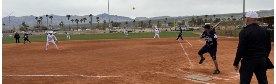
Action Shot at the 40s Spring Worlds in Bullhead City, Arizona.