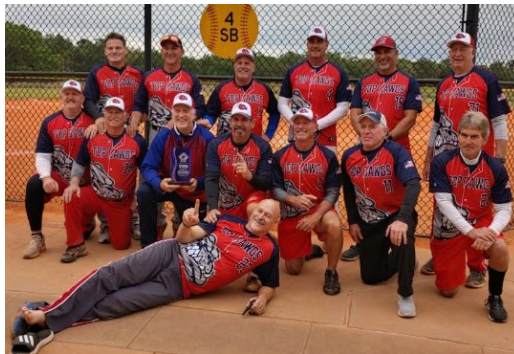
Men's 60+ AAA: Team Mars/Sunshine Sluggers (photo below) proved the best of a three-team, all-Florida bracket. Team Mars defeated Levin/Ameriprise II 31-15 in the finale. The Winter Haven Blue Knights finished third.

Men's 60+ Major: The unbeaten Top Dawgs of Florida (photo below) won the tournament's largest division by defeating RBC Wealth Manager Florida 28-21 in the title game. Team Florida finished third in the five-team bracket.