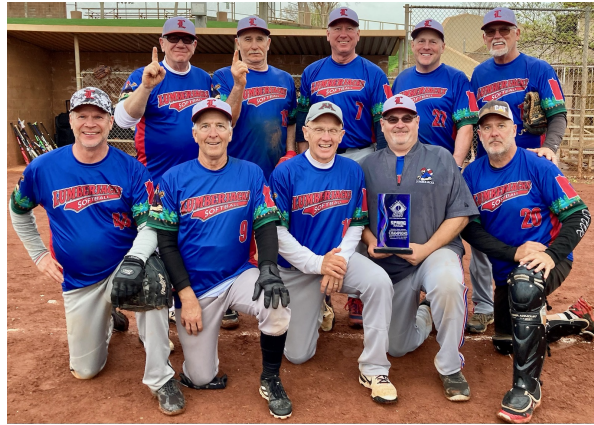
Men's 60+ AA: Club Tilt/Haus of Colorado double-dipped Mike's Bar & Grill of Washington 17-6 and 17-14 to claim this three-team division. Spin of Washington finished third.