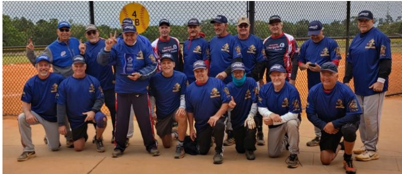
Men's 70/75+ Platinum: Venom, a 75+ Major Plus team from Florida (top photo below), capped a 4-0 tournament with a 21-11 title game victory over Slug-A-Bug (bottom photo below), a 70+ Major team from Florida. AMR South, a 75+ Major team from Florida, finished third in the three-team bracket.