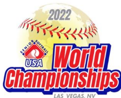
2022 World Championships Logo