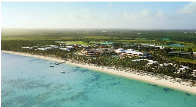
Caribbean Resort of Barceló Bávaro Palace – Home of SSUSA's Caribbean Classic

We look forward to you joining us on the beautiful island of Hispaniola!