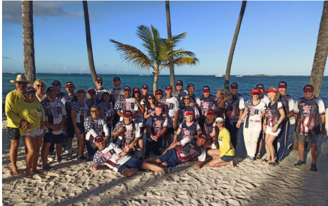
2022 Caribbean Classic USA Teams and Guests.

Word has spread so much about the fun and success of past Caribbean Classic tournaments that our Third Annual Caribbean Classic International Goodwill Tournament has already fulfilled its goal of having two USA Teams.