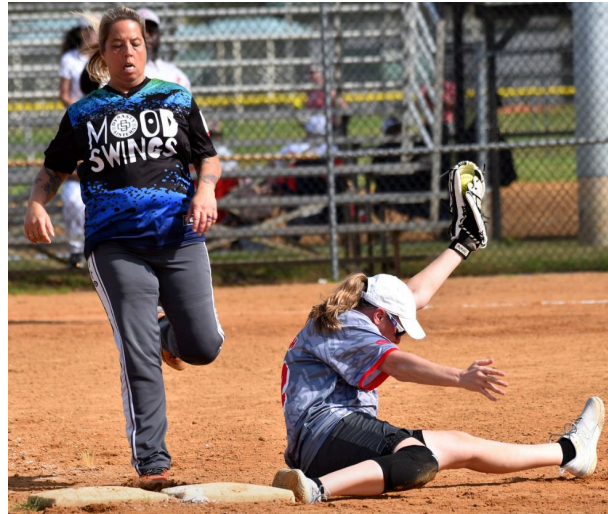
Dynasty Girls Mood Swings (CA) vs. Fireballs (MA) in the Women's 40+ AAA division of the 2024 TOC.

Obituaries: December 2023 – February 2024