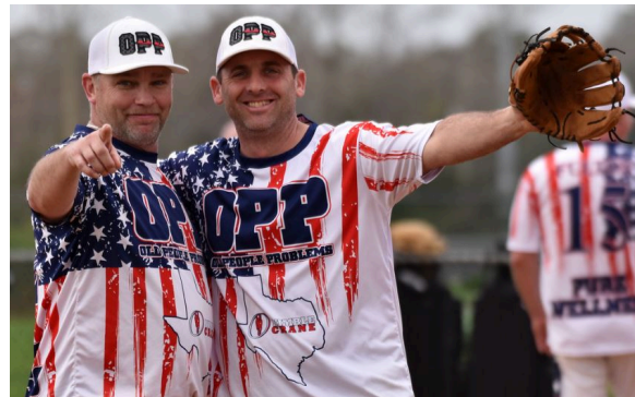
Barkley Heating & Air/O.P.P. (DE) enjoying their championship victory in the Men's 40+ AAA division.

Only teams that win their divisions in TOC qualifiers get invited to the SSUSA Tournament of Champions, which celebrated its 18 th annual showcase event this year.