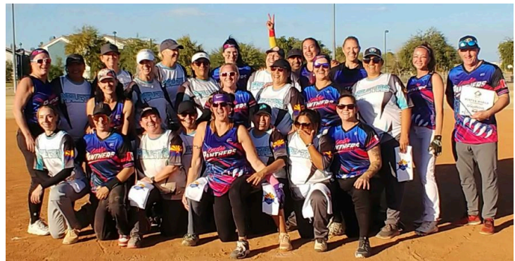
Lady Panthers and Las Maletas photoed together after the championship game.

Women's 40+ Masters Silver: The top-seeded AAA team Lady Panthers of Ontario, Canada, won multiple games by double digits and capped a 6-0 tournament with a 18-14 title game victory over third-seeded Las Maletas of Arizona. Notoriously We Gucci of Arizona finished third in the 14-team division.