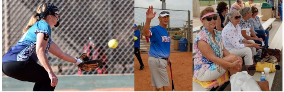
The 2024 Winter National and Winter World Championships Kick Off the SSUSA 2025 Season.