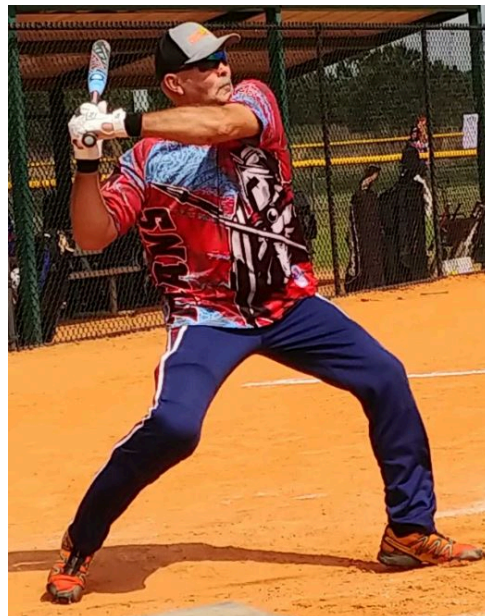
Florida Titans double-dip to win the Men's 55+ AAA division.

One run decided nip-and-tuck title games in three of the divisions. Meanwhile, only two teams compiled undefeated records: Dayton Legends/22Softball/Hudson Automotive of Ohio in the men's 50+ AAA division, and Mitchells 55 of Florida in the men's 55+ Major division.