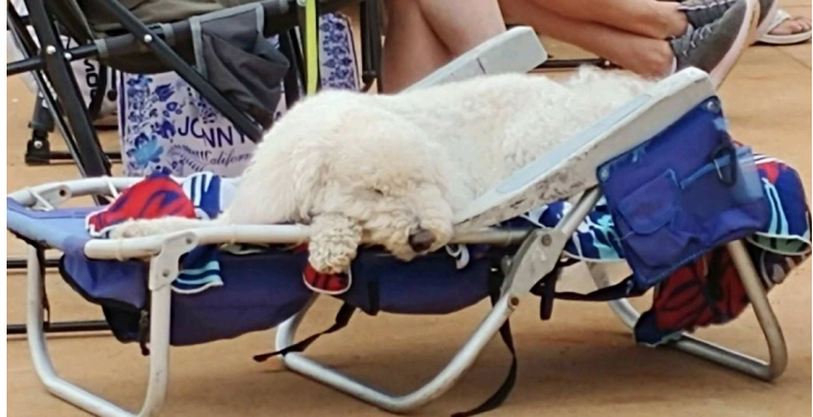
Lazy dog enjoys the great weather at the 2024 Spring Nationals in Polk County, Florida.