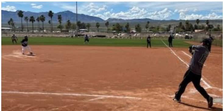
Men's 40+ teams play at Bullhead City's Rotary Park, located between the Colorado River and scenic mountains.

Overall, 117 teams participated. Eight played in the men's 40+ Masters division March 16-17 in Bullhead, Az. All other teams played in one of the two sessions that spanned March 19-24 at parks in Saint George, Utah.