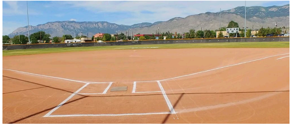
Home of the new Land of Enchantment TOC qualifier, the Los Altos Softball Complex in Albuquerque, New Mexico was newly renovated in 2023.