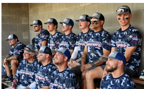
The Louisville Slugger Warriors won last year's inaugural Celebrity Game, 22-11 over the 2023 All-Star team.

The Warriors — a team of military veterans, active service personnel and former collegiate baseball player amputees — travel the country playing ball. They have played for years at SSUSA events, including the Tournament of Champions. Some of their players lost limbs while serving their country, but they have adapted so well with prosthetics that they play lights out.