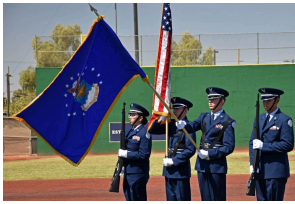
The Honor Guard from North Las Vegas' Rancho High School performed in the opening ceremony of the 2024 Celebrity Game vs. Warriors Game.

The two teams combined for 58 hits, including 24 home runs, during an extra-inning battle won 29-27 by the All-Star squad Sept. 14 at Big League Dreams softball complex.