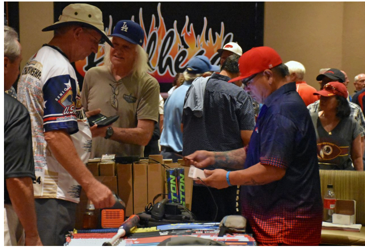
Vendors showcase their newest equipment and apparel to players and managers at the 2024 Worlds' manager registration/receptions.

Neither team could pull away from the other in this second-annual affair. The score was tied 5-5 after two innings, 12-12 after four innings and 27-27 after seven innings. Even the final out came on a hard-hit ball.