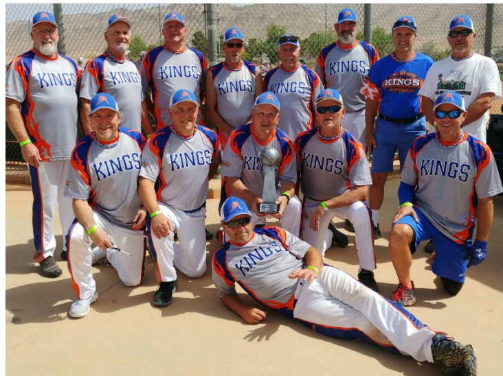
Tri-State Kings of Alaska won the 2024 Sportsmanship Award for always encouraging a positive spirit on the field.

First-session Triple Grand Slam titles were earned by Harford Financial Group of Maryland in 55+ AA, Sommerville Softball of California in 60+ Major Plus, and North Valley Seniors of California in 60+ AAA. Winning a Triple Grand Slam title requires success across multiple events. Team first must win their divisions at the Eastern or Western National Championships. Those winners play each other during pool play at Worlds for the USA National Championship. If the National Champion also wins its Worlds bracket, it earns the Triple Grand Slam.