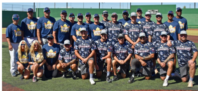
Louisville Slugger Warriors, a team of wounded veterans, poses with the Sin City All-Stars, a team of local Vegas celebrities and former MLB players at the 2024 World Championships.