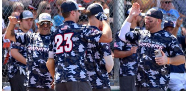
2024 World Championships Kicks Off with session 1 teams (Men's 55-60+) with the second annual Celebrity vs. Louisville Warriors and captivated audiences.