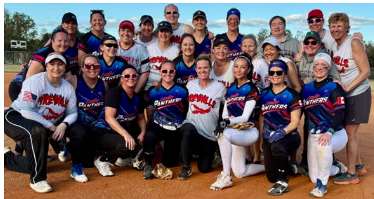
Lady Panthers, Women’s 40+ Gold Championships, with finalists Fireballs.

Women’s 40+ Masters Gold: The top-seeded Lady Panthers of Ontario, Canada, lost the first title game 15-7 before capturing an “if needed” championship game victory 21-4 over the second-seeded Fireballs of Massachusetts. The win earned the Lady Panthers the AAA crown. Firestarter Oldies of Washington, which finished third in the four-team bracket, won the Major division title.