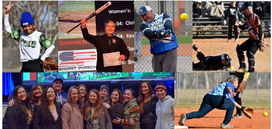
104 teams competed in Senior Softball USA's 19th annual Original Tournament of Champions, which included skill contests, an All-Star Game, a reception highlighting all teams and a chance to prove who was the best of the best.