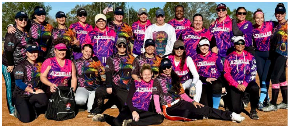
Women’s 40+ AA Champions, Arizona Desert Belles, went undefeated against finalists, Idaho Spirit.

Women’s 40+ Masters AA: Playing a best-of-three format, the Arizona Desert Belles swept Idaho Spirit 11-9 and 22-7. That gave the Belles a perfect 5-0 tournament record.