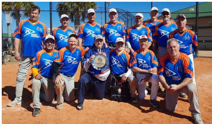
Men's 65+ AAA: Unbeaten in five games, top-seeded Spring Ford of Pennsylvania crushed fourth-seeded Dinos of New Hampshire 17-2 in the championship game. The third-seeded Northeast Jackhammers of New York secured third place in the seven-team bracket.