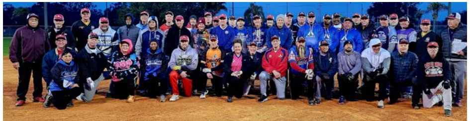
All-Star Game Champions, the National All-Stars in the red caps, posed with the finalists, the American All-Stars in the blue caps.

The 19 th annual Original TOC also featured an all-star game, skills competitions, an award-filled reception, and a large cast of characters from across North America. (For more information about the All-Star Game, please find the All-Star Game story, left).