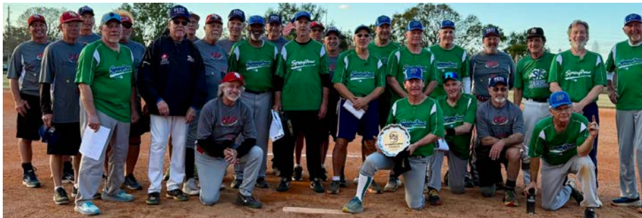
Spring Ford 70+, 65/70+ Silver Champions, with finalists MP Components/Bomb Squad.