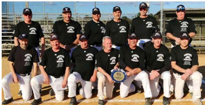
Men's 65+ Major: Third-seeded Agway Steelers of Ontario, Canada, (photo below), defeated the top two seeds enroute to a 23-22 championship victory over top-seeded DT Express of Georgia. Agway finished 4-1 overall. Fifth-seeded Action Auto Parts of Rhode Island finished third in the five-team bracket.