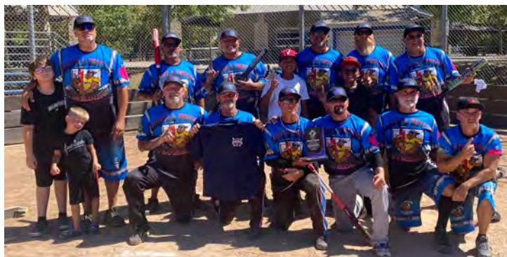
Men's 50+ AAA: Third-seeded EUV Tech of California ( photo below ) started bracket play with a 29-28 win over the team it would meet again in the championship: CaliGold 50 of California. Though CaliGold won the first title game 21-15, EUV Tech controlled the second 22-4 to capture the five-team division. Fourth-seeded Central Cal 50s finished third.