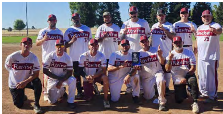
Men's 40+ AAA: Top-seeded Hella Nor-Cal ( photo below ) capped a 4-1 tournament with a 20-15 championship victory over third-seeded T.N.T. (Tacos & Tequila) of California. Second-seeded GTR of Oregon finished third in the three-team division.