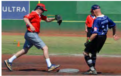
The 90s West team wore blue jerseys this year, as the 90s East team wore red.

against the West at Big League Dreams in an event that drew a large crowd of family, other players and fans.