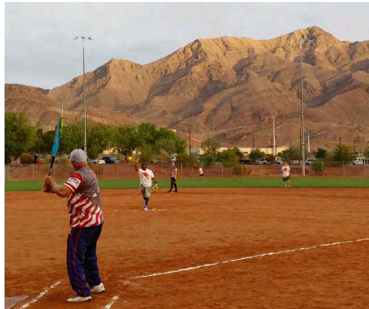
Beautiful mountain backdrop at Shadow Rock Softball Complex in Vegas as the batter prepares to swing during the opening day of the SSUSA 2025 World Championships.