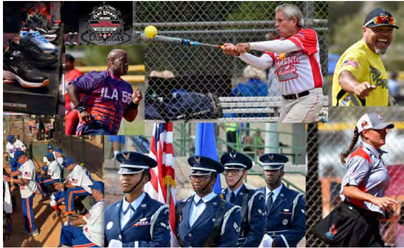
Sessions 1 and 2 of the largest ever 2025 World Championships saw the return of 368 teams, vendors at the Manager Receptions/Registration, 90s Game, Hall of Fame, and the Nellis AFB Color Guard for the opening ceremonies.