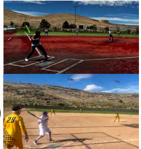
Reno, America's Biggest Little City, is home to the oldest senior softball tournament, bringing teams from coast to coast, including Hawaii and Canada.