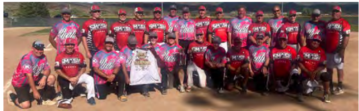
Chelu and SMASH posing together after the championship game at Centennial Park in Carson City.

Men's 60+ Silver: Seven teams went 2-0 in seeding play, but none won the bracket. Instead, the eighth-seeded AAA team Chelu 60s of Oregon triumphed by averaging 25 runs in its seven bracket games. It lost in the winner's final (the only time it didn't score at least 20 runs) before double-dipping sixth-seeded SMASH of California 23-22 and 27-12 to win the 18-team division. Ninth-seeded Six Five O's of California won six elimination games to finish third.