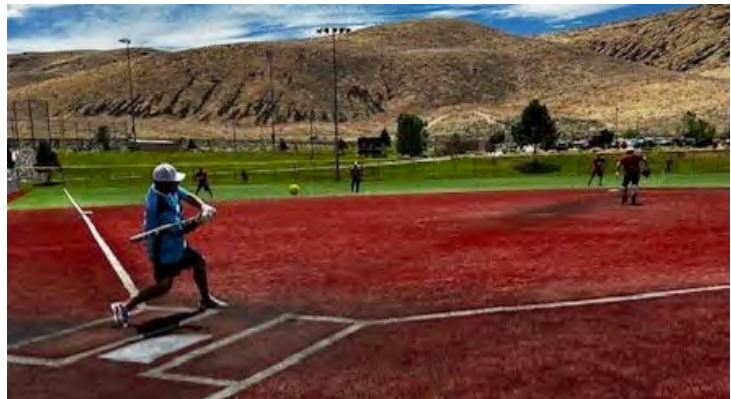
30 teams earned berths at Reno, to join the 2026 Original Tournament of Championships in Florida, January 21-25.

Teams from Arizona, Colorado, Texas, Oregon, Utah and Washington also collected first-place awards and berths to the 2026 Tournament of Champions in Polk County, Florida.