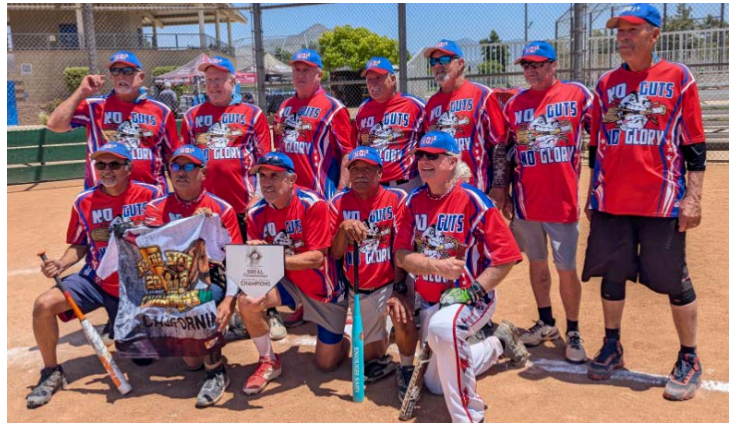
Men's 75/80+ Gold: Top-seeded Git-R-Done 75, a AAA team from Arizona (photo below), capped a 6-0 tournament with a 13-8 title-game victory over second-seeded Top Gun 80 Gold. The third-seeded So Cal Warriors 75s finished third in the four-team bracket.