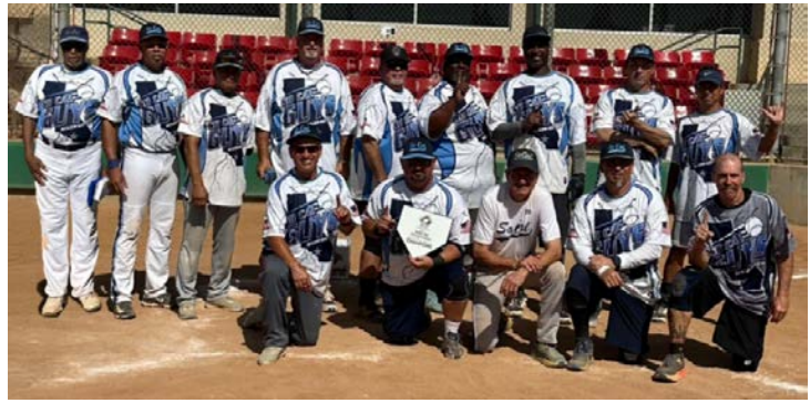
Men's 60+ Major: Undefeated in six games, the top-seeded Top Gun Warriors ( photo below ) nipped third-seeded Custom Truck of Nevada 23-21 in the championship game. Fourth-seeded Team Rawlings captured third in the four-team division.