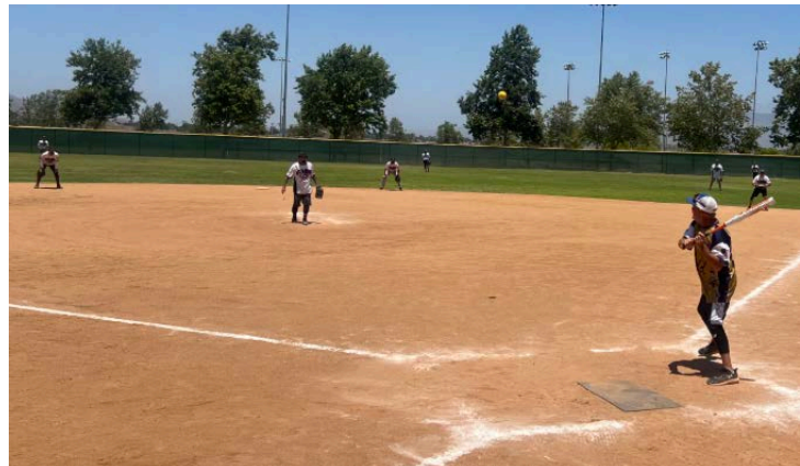
Diamond Valley Sports Park is located near Diamond Valley Lake, south of Hemet.

Eleven women's teams and 58 men's teams competed in the six-day tournament played at Diamond Valley Lake Sports Complex in Hemet and at the West Covina Sportsplex in West Covina.