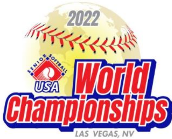
2022 World Championships Logo