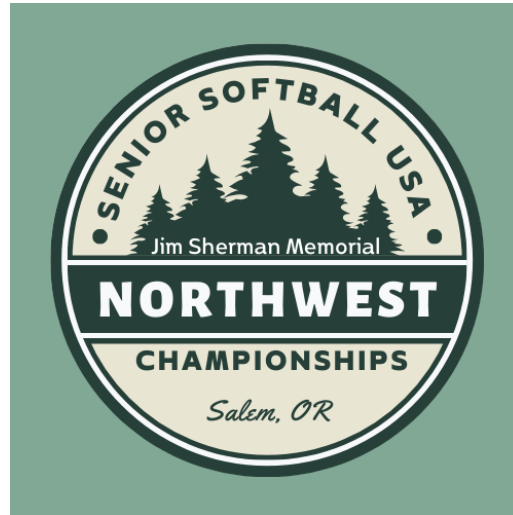
2023 Jim Sherman-Norhtwest Championships Logo