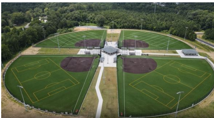
Riverbend Park, opened in 2022, host of the Southern Championships in Dalton, GA.