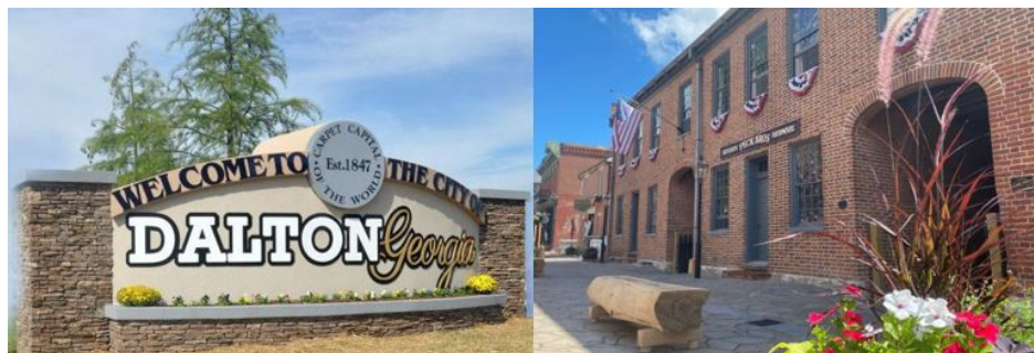
Welcome to Dalton, GA Sign and Historic Downtown St. Charles, home of the Southern and Midwest Championships, respectively.