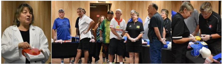
SSUSA Directors, Umpires, and Staff attend CPR/First Aid Training before 2023 Worlds.