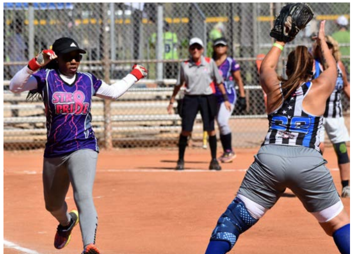
Straight Pride 50s (CA) playing against Shots Fired (RI), USA National Women's

The final session involved the men's 50+ divisions, the women's 50+ and 55+ divisions, and an international coed division.