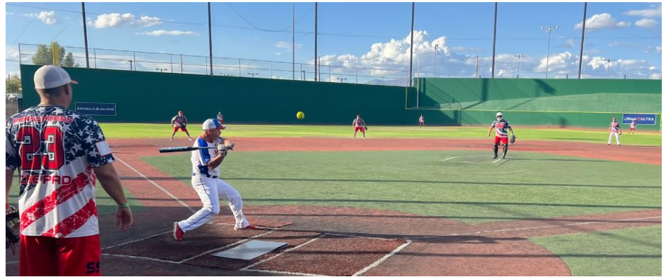
Reds Boys (KY) batting, beat the SSC/Persuaders 16-12 to win the 50+ AAA Championships.