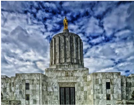
Oregon State Capitol Building, located in Salem

Location: Salem, OR Dates of Play: July 12-17, 2022 Deadline: Friday, June 28, 2022 Entry Fee: $555