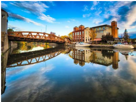
The historic Erie Canal runs right through Syracuse.

Location: Syracuse, NY Dates of Play: July 8-13, 2022 Deadline: Friday, June 24, 2022 Entry Fee: $555