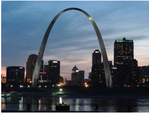
St. Louis' Gateway Arch, 30 minutes out of St. Charles.