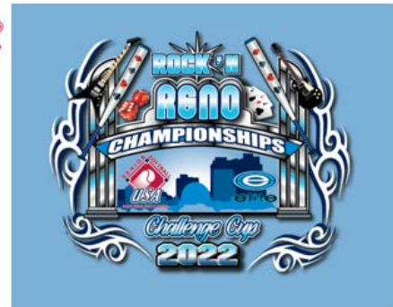
Atlantic Coast Championships and Rock 'N' Reno Challenge Cup Logos, by Elite Sports