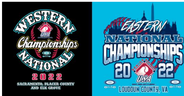
2022 Western and Eastern National Championships' Logos

East vs. West: 57 Teams Earn Berths to USA National Championships at Worlds World Championships Deadlines Approach Only 3 out of 77 Teams Go Undeclared in 2022 Jim Sherman Memorial/Northwest Championships Updated 2023 TOC Invite List Never Know Who You'll Meet at the Tournaments