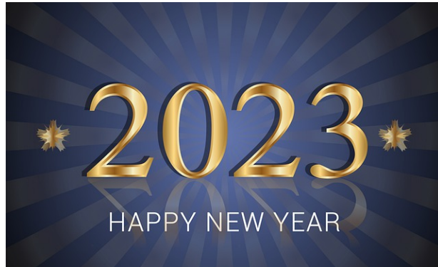
2023 Starts With New Rules and New Tournaments!

SPA and SSUSA to Run 4 Joint Tournaments in 2023