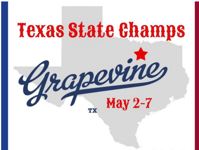
2023 Texas State Championships