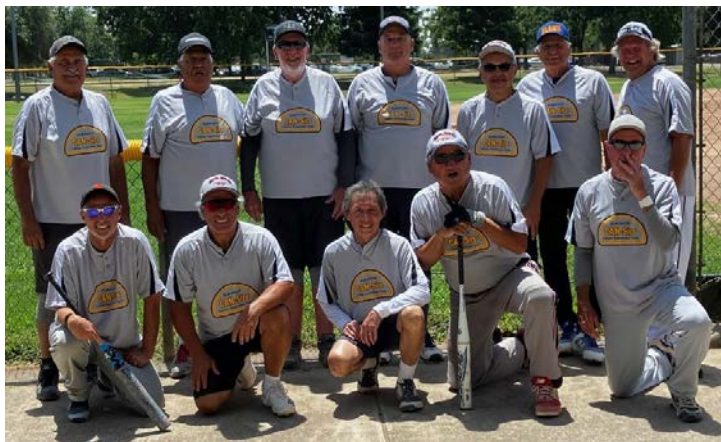
CAN-Sirs Exhibition 70 AAA Team at the 2023 CAN-Sirs/SSUSA Northern California State Championships.

On Field 4, a pitcher for the 55+ Major team JU Entertainment of California collapsed to the ground after a sharply batted ball struck him in the groin. Fortunately, the pitcher recovered and remained in the game.