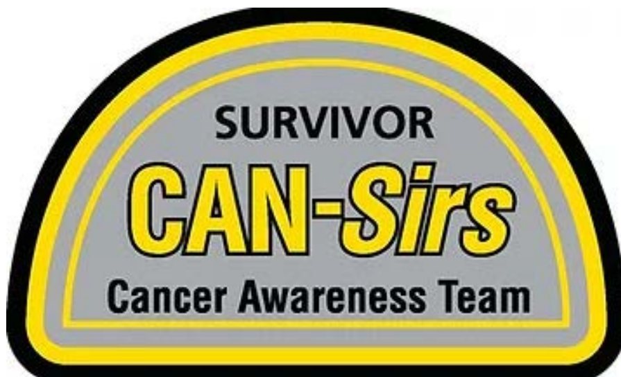
CAN-Sirs logo, a Northern California Senior Softball league dedicated to cancer awareness.