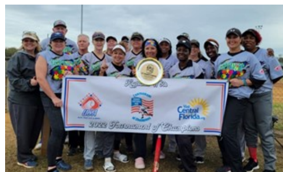
Women's 50+ Major TOC Champions, Kryptonite (FL).

Having Trouble Viewing Our Email Newsletter?