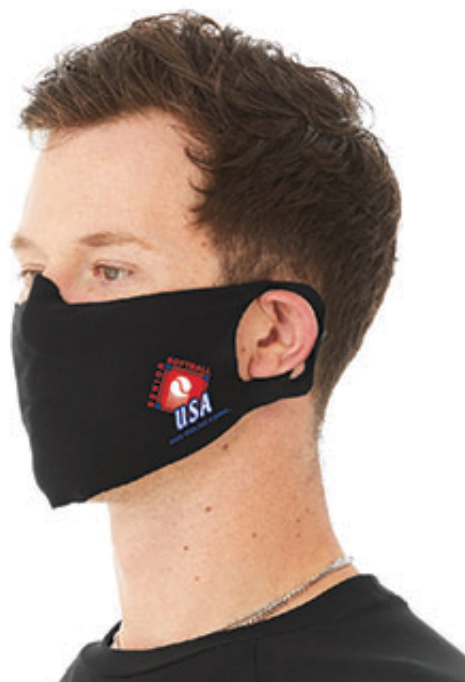
SSUSA face mask

Masks and gaiters will be available next week. Masks are $10 plus shipping and gaiters are $15 plus shipping.