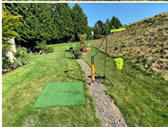
Art Eversole's backyard BP setup