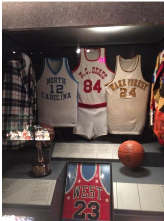
North Carolina Sports Hall of Fame

Thanks for playing SSUSA and good luck in 2021!