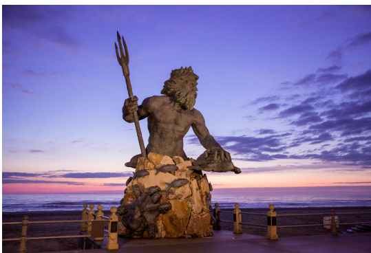
King Neptune - Virginia Beach