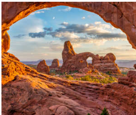
Arches National Park

*Please Note: there is currently a wait list for Session 2 (Men's 65 - 85).