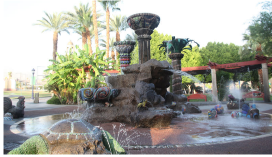
Fountain of Life - Cathedral City.

Banks was also a member of BH Maintenance 50, Straight Gas 50, and Pill & Pill 55.