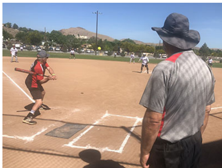
Action shot from the Men's 80 Major Division

The Scrap Iron Grey Berets swept the series, by scores of 18-15 and 11-7, respectively.