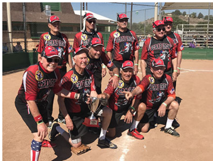
Scrap Iron Grey Berets (CO) Men's 80 Major Champions