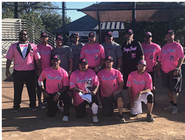
Cheap Suits/Republic Realty/Express Athletics 40 (CA) Men's 40/50 Platinum Champions

Universal Slowpitch 40 (CA) finished in fourth place.