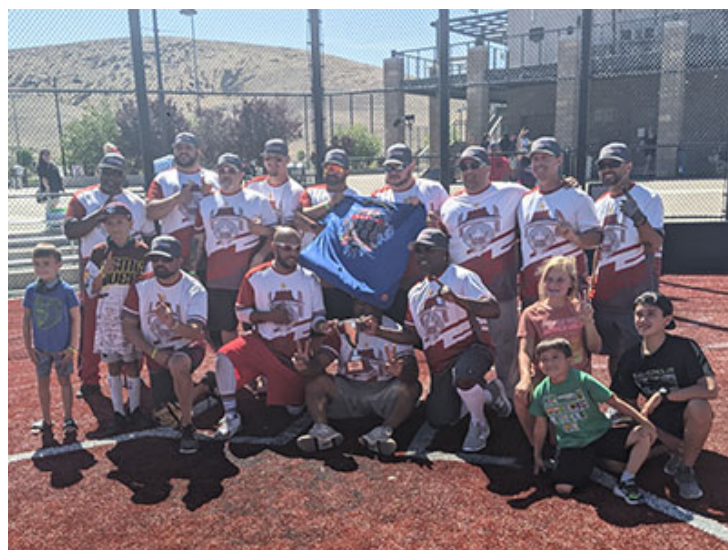
Game Over (CA) Men's 40 AAA Champions

In the three-team Men's 40 AAA Division, top seed Game Over (CA) went 2-0 in bracket play, including a 29-25 win over NFL2G (CA) in the championship game.