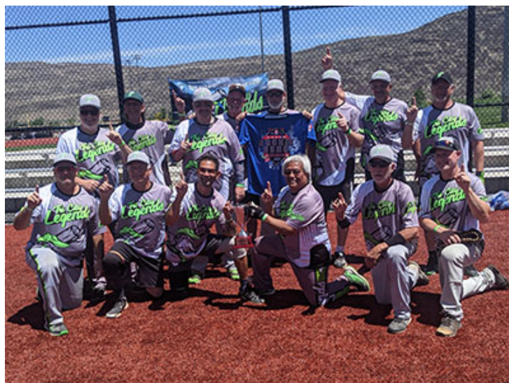
Tri-City Legends/TimeShareCompliance.com Men's 60 AA Champions

In the three-team Men's 60 AA Division, Tri-City Legends/TimeShareCompliance.com (WA) went 3-0 in bracket play, including a 14-4 win over East West Aircraft (ID) in the championship game.