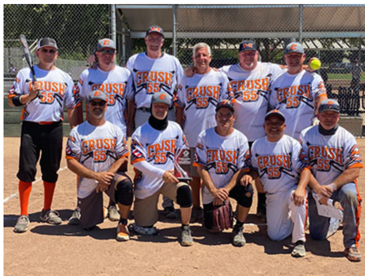
Crush 55 (CA) Men's 50/55 Platinum Champions

In the four-team Men's 50/55 Platinum Division, top seed Crush 55 (CA) posted an undefeated weekend, which included a 14-7 win over BR & Company 50 (CA) in the championship game.