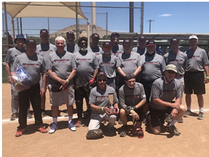
General Equipment 75 (OR) Men's 75/80 Platinum Champions

In the four-team Men's 75/80 Platinum Division, General Equipment 75 (OR) went 3-0 in bracket play, including a 22-13 win over State Roofing Systems 75 (CA) in the championship game.