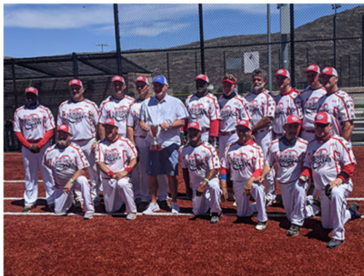
Legacy Sports USA (AZ) Men's 60 Major Plus Champions

There will be one (1) free entry for each session of the World Champs (Men's 55/60, Men's 65 - 85,