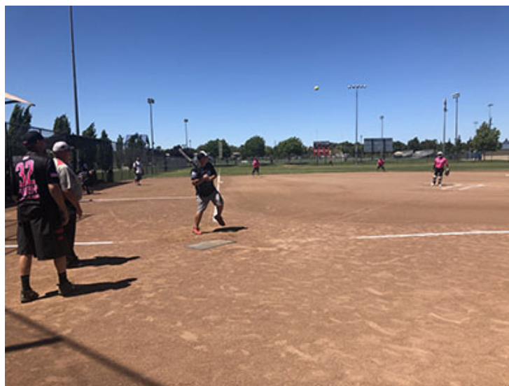
Action from the Men's 40/50 Platinum Championship Game

In the rubber-match, Cheap Suits avoided the dreaded double-dip, by gutting out a 25-24 comeback victory in extras.