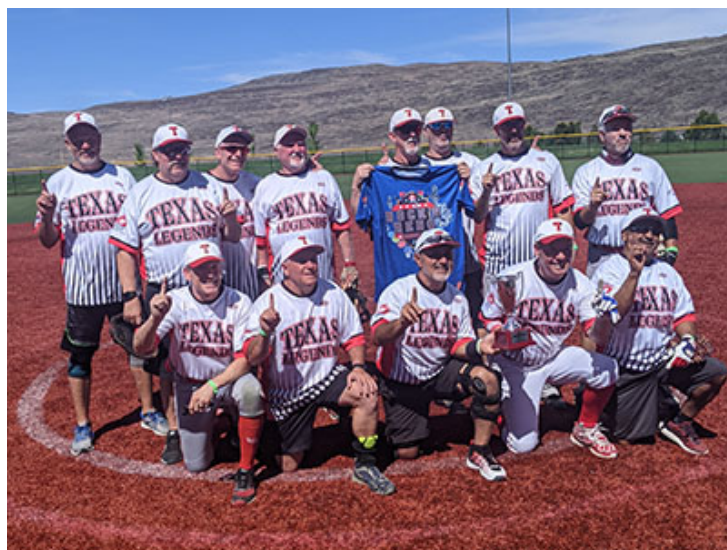
Texas Legends 60 AAA Champions

In the 13-team Men's 60 AAA Division, the No. 4 seed would come out victorious as well, as Texas Legends went 5-0 in bracket play, including a 20-16 win over No. 2 seed Yahoos (WA) in the championship game. The win capped off an undefeated weekend for Texas Legends.