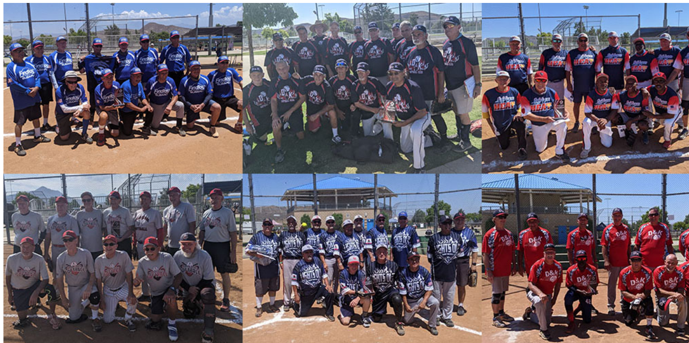
Top Row (L-R): Scorpions 80, D & K Softball 70, Las Vegas Heat 70