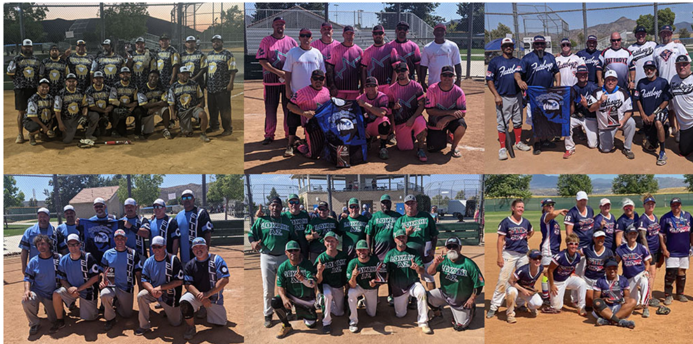
Top Row (L-R): Skrewballs 40, Flatliners 40, Fattboyz/Elite 40 Bottom Row (L-R): Scrap Iron/Elite 50, Lokahi AZ 50, Stix With Impact 50

The tournament continued with the Men's 40 to 55 age divisions and Women's 40 to 50 age divisions taking the field on June 25. 54 teams competed over the weekend.