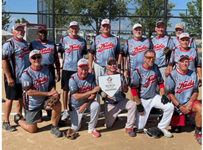
KC Kids 70 (MO) - Men's 65/70 Gold Champions

In the seven-team Men's 65/70 Gold Division, KC Kids 70 (MO) went 4-0 in bracket play, including a 20-7 win over top seed Peak Softball/Scrap Iron 65 (CO) in the championship game.