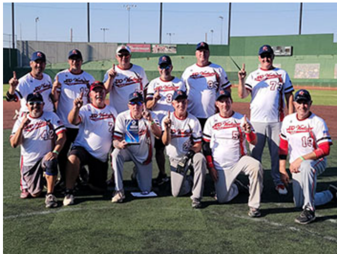
KC Vintage (MO) - Men's 55 AAA World Champions