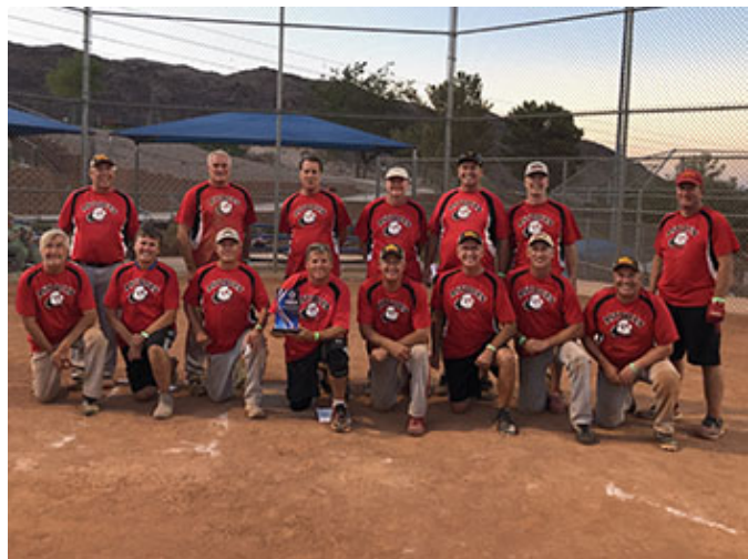
Antiques of Iowa City (IA) - Men's 60 AA World Champions