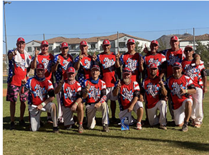
Rock N Legends 9 (TX) - Men's 55 Major World Champions

In the 32-team Men's 55 Major Division, Dugout/Mid-Atlantic/Dudley (VA) bested L.A.F (CA), 29-26, for the U.S. National Championship title.