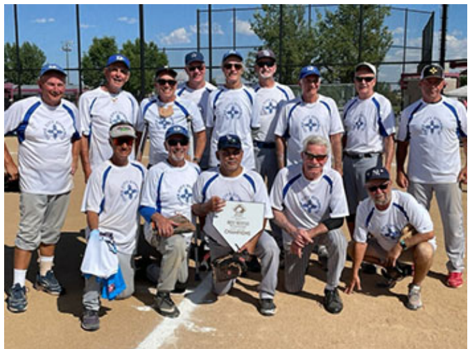
Duke City Dynamite (NM) - Men's 65 AA Champions

In the three-team Men's 65 AA Division, Duke City Dynamite (NM) went 3-0 in the bracket, including a thrilling 35-34 win over top seed Scrap Iron Diamonds (CO) in the championship game.