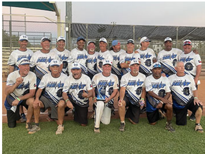
Texas Heat - Men's 60 AAA World Champions

CLICK HERE for a brief video of the resort, showing the various sports offered.