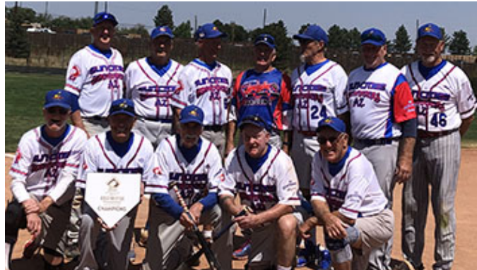
Sidewinders (AZ) - Men's 75 Major Champions

In the rubber-match, Sidewinders continued its winning ways, taking home the 18-10 victory.