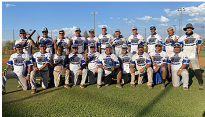
LPC/Dudley (CA) - Men's 60 Major Plus Back-to-Back-to-Back-to-Back World Champions

In the five-team Men's 60 Major Plus Division, Legacy Sports USA (AZ) took home the U.S. National Championship via its 28-21 victory over Omega IT Services, LLC (VA).