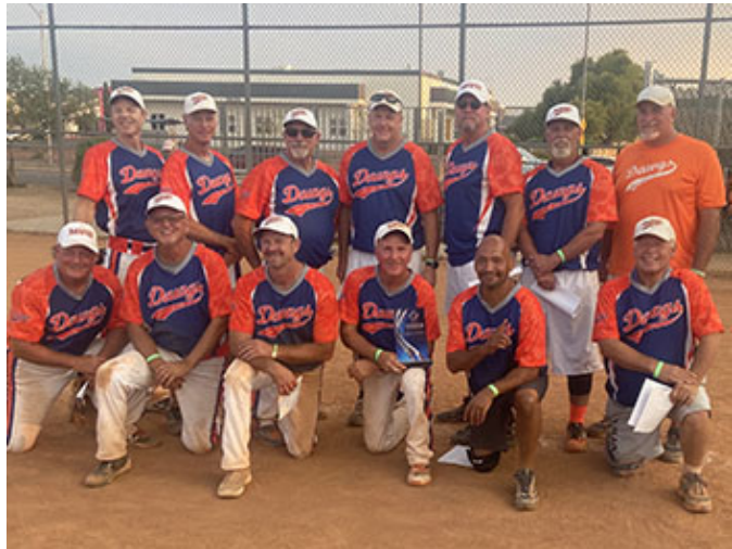
Salty Old Dogs (TX) - Men's 55 AA World Champions

The 2021 SSUSA National Convention will take place Monday, November 29 - Thursday, December 2, in SSUSA's home city of Sacramento, Calif.