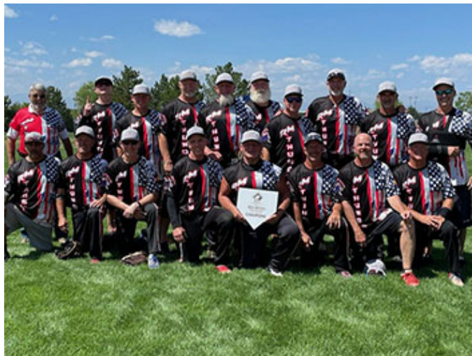
Scrap Iron/Rocky Mountain Thunder - Men's 60 Major Champions

The five-team Men's 60 Major Division also featured the home team win it all, as top seed Scrap Iron/Rocky Mountain Thunder went 3-0 in the bracket, including a 20-18 win over Arizona Old School.