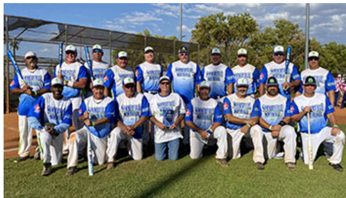
Sommerville Softball (CA) - Men's 55 Major Plus Back-to-Back-to-Back World Champions

In the eight-team Men's 55 Major Plus Division, BPA (PA) cruised passed Sommerville Softball (CA), 28-12, for the U.S. National Championship.