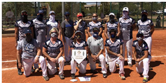
Old School (CA) - Women's 50 Major Champions