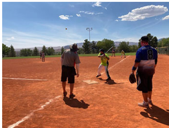
Beautiful skies above the 2020 Western National Championships

SSUSA put on four major championship tournaments in August, as Texas, Utah, Michigan and Florida hosted a combined 261 teams.