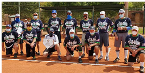
Git-R-Done (CA) - Men's 80 AAA Champions

For complete game-by-game scores, please CLICK HERE .