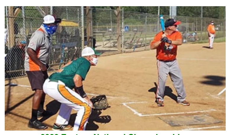
2020 Eastern National Championships

Despite cancellations of major SSUSA regional championships (Northeast and Midwest Championships) and various other qualifiers, the month of July was a busy one, with nine qualifiers taking place across the country, including two major tournaments.