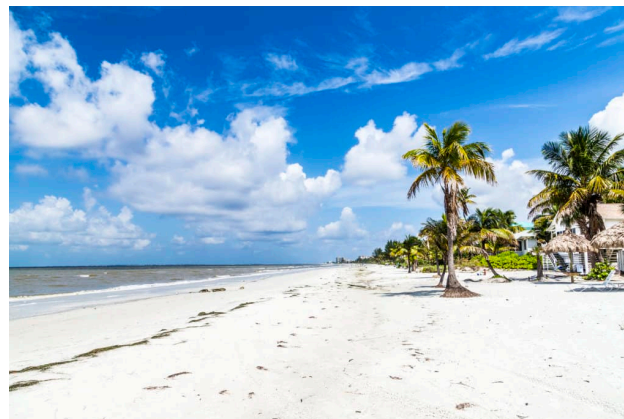
FT. MYERS BEACH

The 2021 season will officially kick-off in November with the Winter Nationals Championships (Florida) and the Winter World Championships (Arizona). Both tournaments are 2021 roster events.