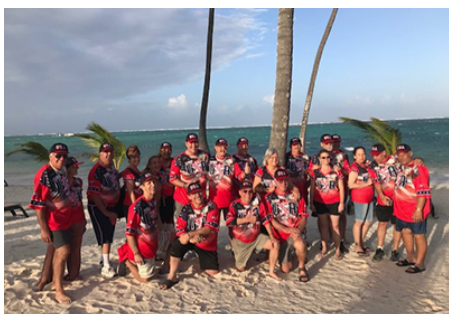
Participants from the Inaugural SSUSA Caribbean Classic

The Second Annual Caribbean Classic in Punta Cana, Dominican Republic, which was scheduled for February 17-22, 2021, has been postponed.