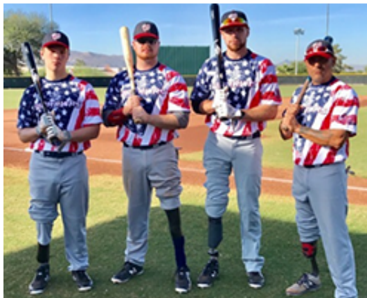
Members of the Louisville Slugger Warriors