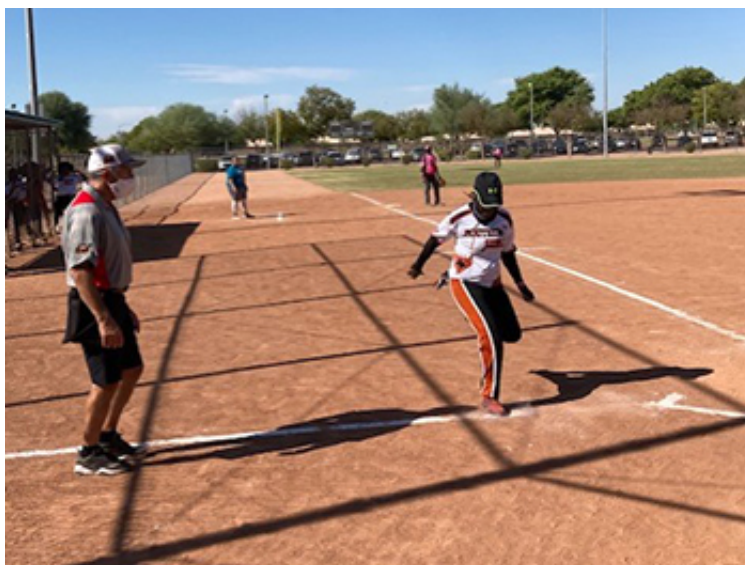
GoFetch (CA) runner comes home to score in the championship game of the Women's 50 AAA Division.

In the three-team Women's 50 AAA Division, top seed GoFetch (CA) defeated NW Lady Warriors/Miken (WA), 15-14, and Southern Girls (TX) 17-12 to take on the