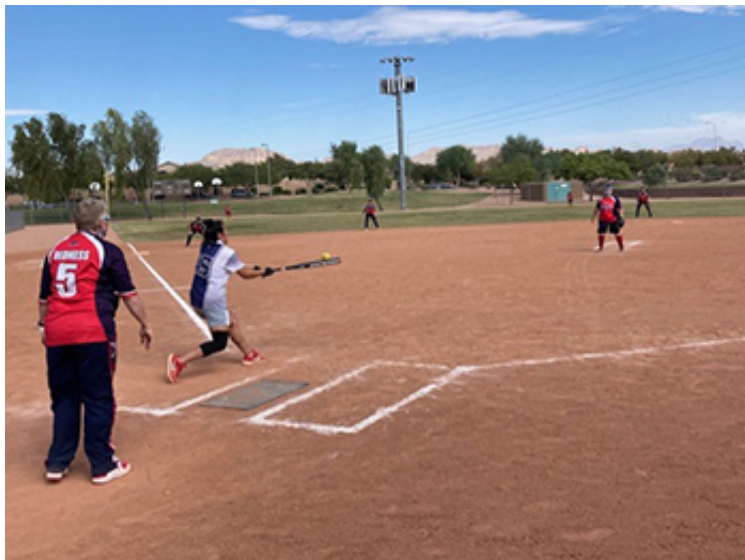
Old School (CA) batter looks to get a rally going in the championship game of the Women's 50 Major Division.