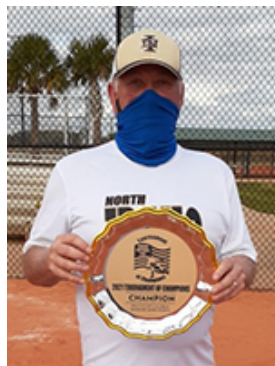
North Idaho Softball Club - Men's 65 AAA Champion

In the eight-team Men's 65/70 Gold Division, North Idaho Softball Club 65 polished off a flawless weekend, going 2-0 in seeding play, and 4-0 in bracket play, including a thrilling 15-14 win over top seed Florida Mustangs 65 in the championship game.