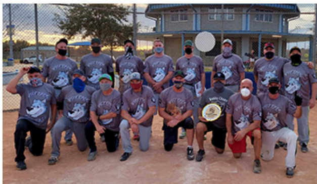
Larry's Tire/Michigan Wolf Pack - Men's 55 Major Champion

The six-team Men's 55 Major Division came down to the "if" game, as Larrys Tire/Michigan Wolf Pack (MI) avoided the dreaded double-dip, earning the 21-16 victory in the decisive game over Iowa Demons, following a 17-16 loss in the championship game.