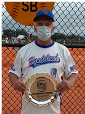
Handeland Flooring (WI) - Men's 70 Major Champion

As the lone 70 Major team, Handeland Flooring (WI) automatically earned first place awards.