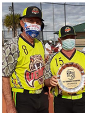
Venom 70 (FL) - Men's 70 Major Plus Champion

In the four-team Men's 65/70 Platinum Division, Venom 70 (FL) completed the perfect weekend, going 3-0 in seeding play, and 3-0 in bracket play, including a 20-14 win over Slug-A-Bug 65 (FL) in the championship game.