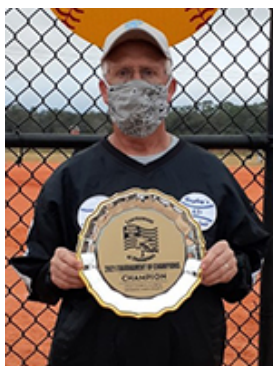
Bags Softball (IA) - Men's 65 AA Champion

The Men's 65 AA Division featured a best-of-three series between Bags Softball (IA) and Blue Chips (IL). Bags Softball swept the series, winning 26-16 and 16-15.