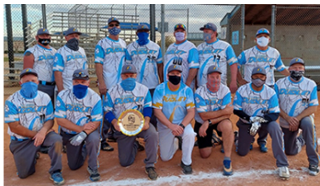
Dudley Lightning Midwest (MO) - Men's 60 Major Champion

Dudley Lightning Midwest won one-run thrillers in both the Championship and "If" game, by identical 22-21 scores.