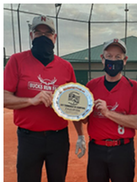
Bucks Run Farms (NE) - Men's 60 AA Champion

Bucks Run Farms completed the double-dip, winning the rubber match with another one-run thriller, 13-12, in the deciding game.