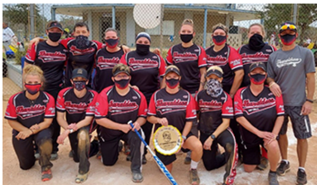
Tharaldson Softball (NV) - Women's 40 AAA Champion

The Men's 40/50 Major Plus Division featured a sibling rivalry, with Suncoast Adidas 40s (FL) and Suncoast/Adidas/Shades 50s (FL) playing a best-of-three game series.