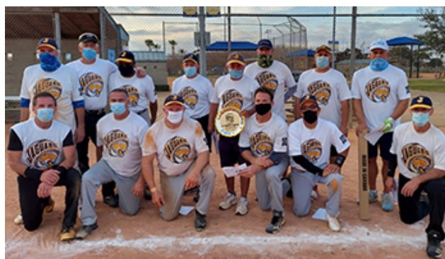
Long Island Jaguars (NY) - Men's 60 AAA Champion

Avenging their earlier loss in the day, Long Island Jaguars completed the comeback, winning both the championship (24-20) and "if" (13-7) game.